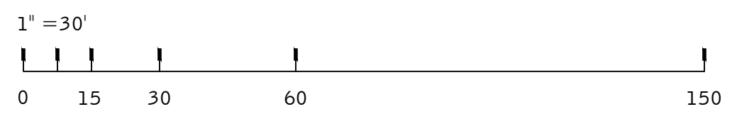
FIRE PLAN SCALE: 1" = 30'-0"

C.O.S. NOTE: KEY SWITCH/PRE-EMPTION SENSOR* PER FIRE ORD. 4562 SEC. 503.6.1