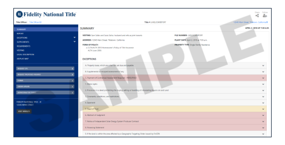
Effortless, Efficient, Compliant, and Accessible

To view your new Fidelity National Title LiveLOOK report, Click Here