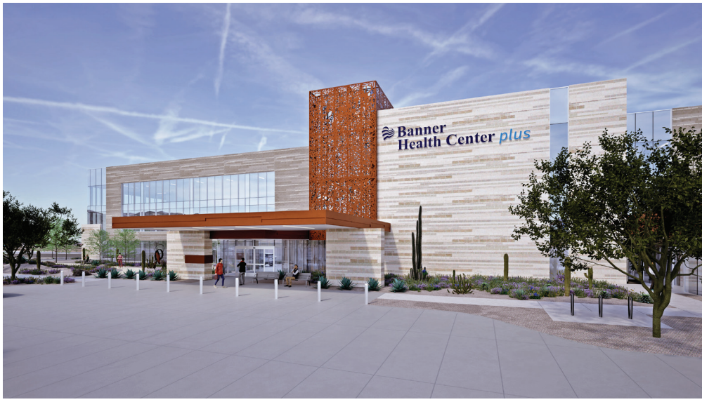
ENTRY PERSPECTIVE FROM THE NORTH (LOOP 101)