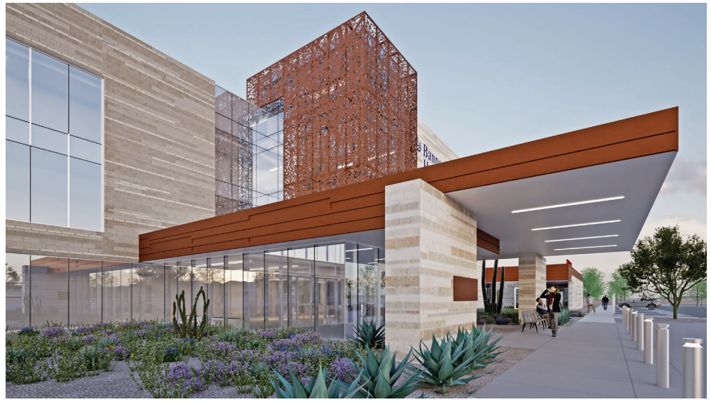
ENTRY PERSPECTIVE FROM THE NORTHEAST (HAYDEN / 101)