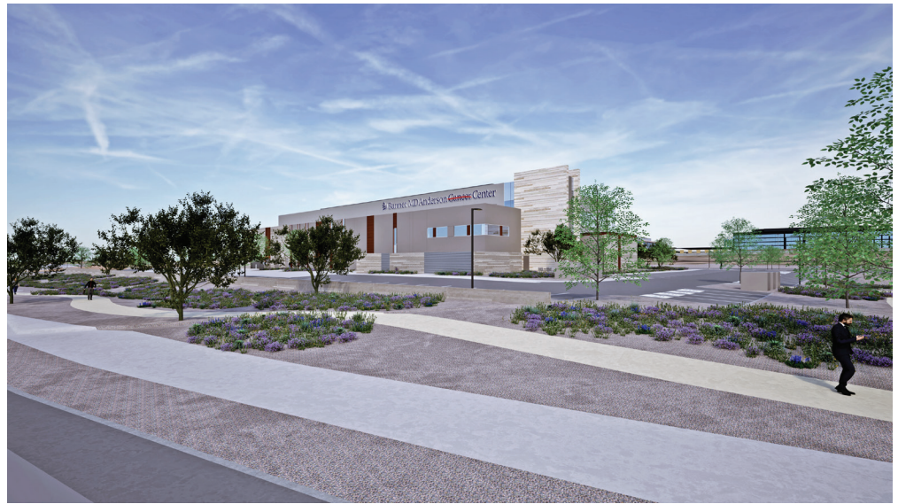
SOUTHWEST PERSPECTIVE FROM MAYO BOULEVARD