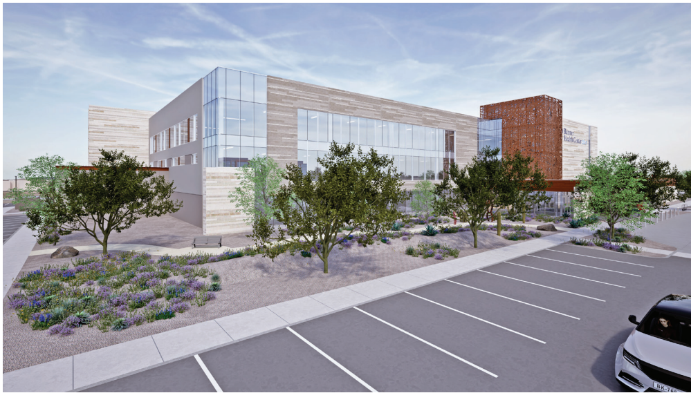
ENTRY PERSPECTIVE FROM THE NORTHEAST (HAYDEN / 101)