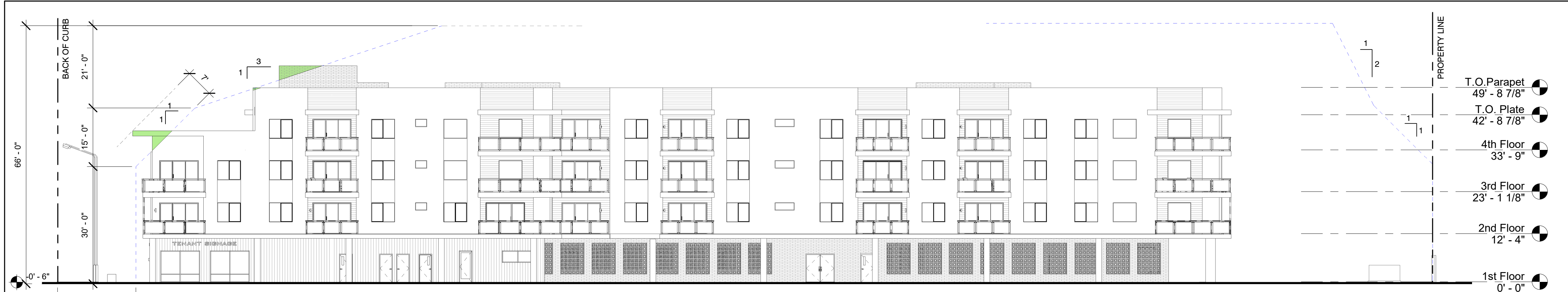
1 North Elevation - Worksheet 1/16" = 1'-0"