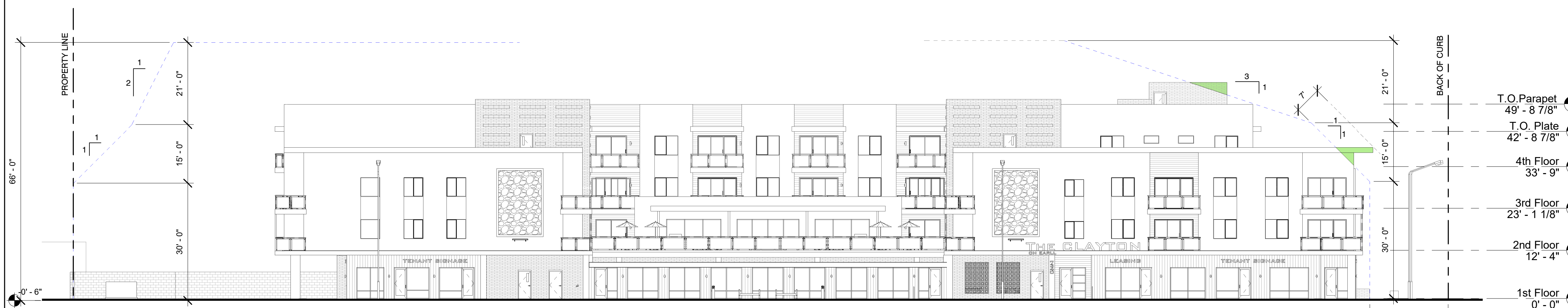
3 South Elevation - Worksheet 1/16" = 1'-0"