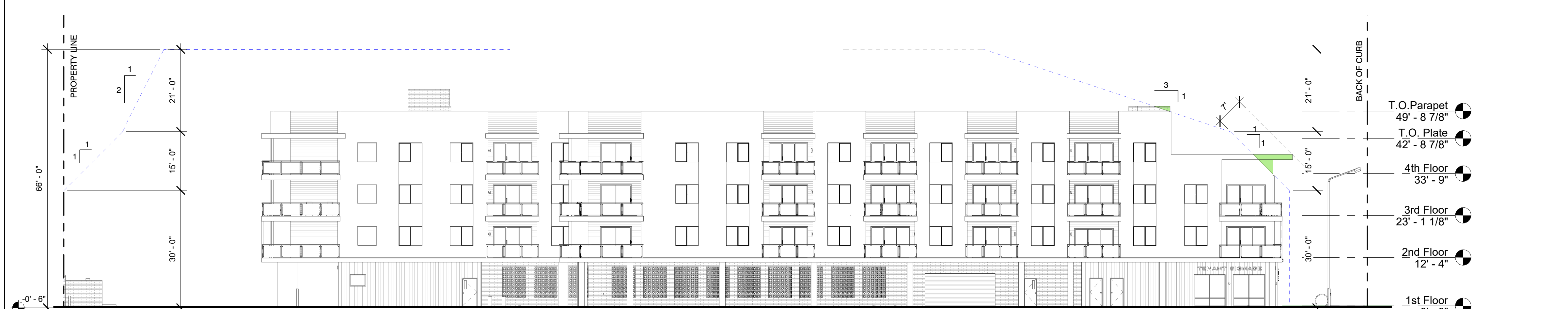
4 West Elevation - Worksheet 1/16" = 1'-0"

LEGEND ■ INDICATES ALLOWABLE EXCEPTIONS TO BUILDING STEPBACK STANDARDS PER SUBSECTION 5.3006.1.2 (EAVES, PARAPETS, CANOPIES, BALCONY WALLS AND RAILINGS) AND 5.3006.1.4 (STAIRS AND ELEVATORS). ■ INDICATES ALLOWABLE EXCEPTIONS TO BUILDING STEPBACK STANDARDS PER SUBSECTION 5.3006.1.3 (PROJECTIONS). GENERAL NOTES FINISH FLOOR ELEVATION OF 0'-0" ESTABLISHED AT 18" ABOVE AVERAGE TOP OF CURB ALONG STREET FRONTAGE. AVERAGE TOP OF CURB ALONG EARLL DRIVE = 1237.17 BUILDING HEIGHT MEASURED FROM FFE = 1238.50 STEPBACK PLANE SHOWN STARTING AT -6" BELOW AVERAGE TOP OF CURB ALONG CIVIC CENTER PLAZA = 1237.00 BUILDING HEIGHT MEASURED FROM FFE = 1238.50 STEPBACK PLANE SHOWN STARTING AT -6" BELOW