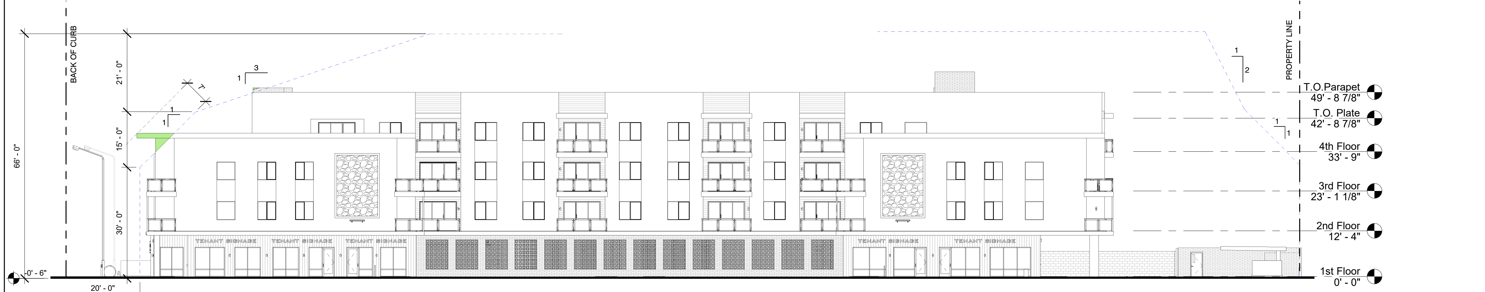
2 East Elevation - Worksheet 1/16" = 1'-0"