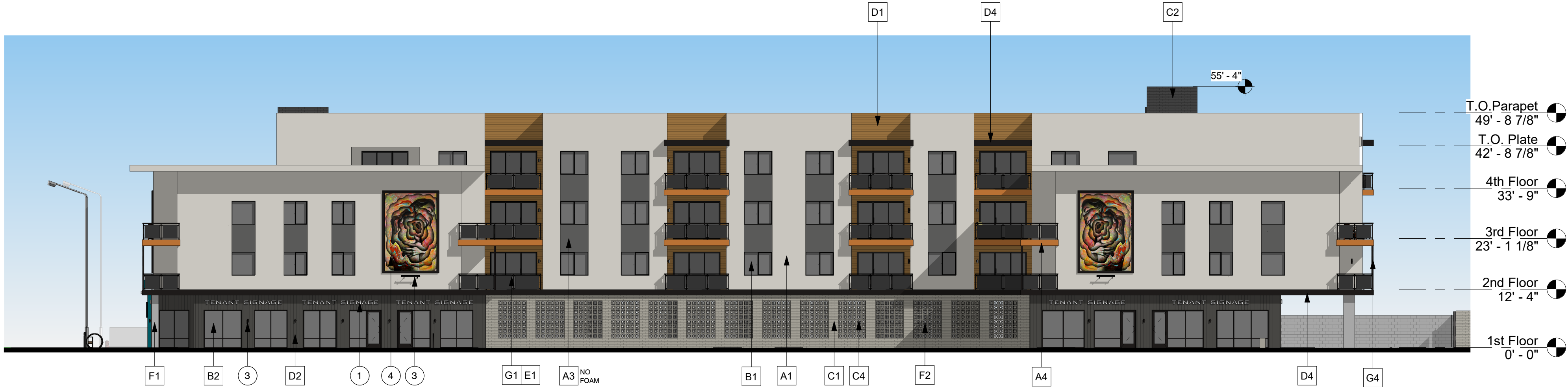
2 East Elevation 1/16" = 1'-0"