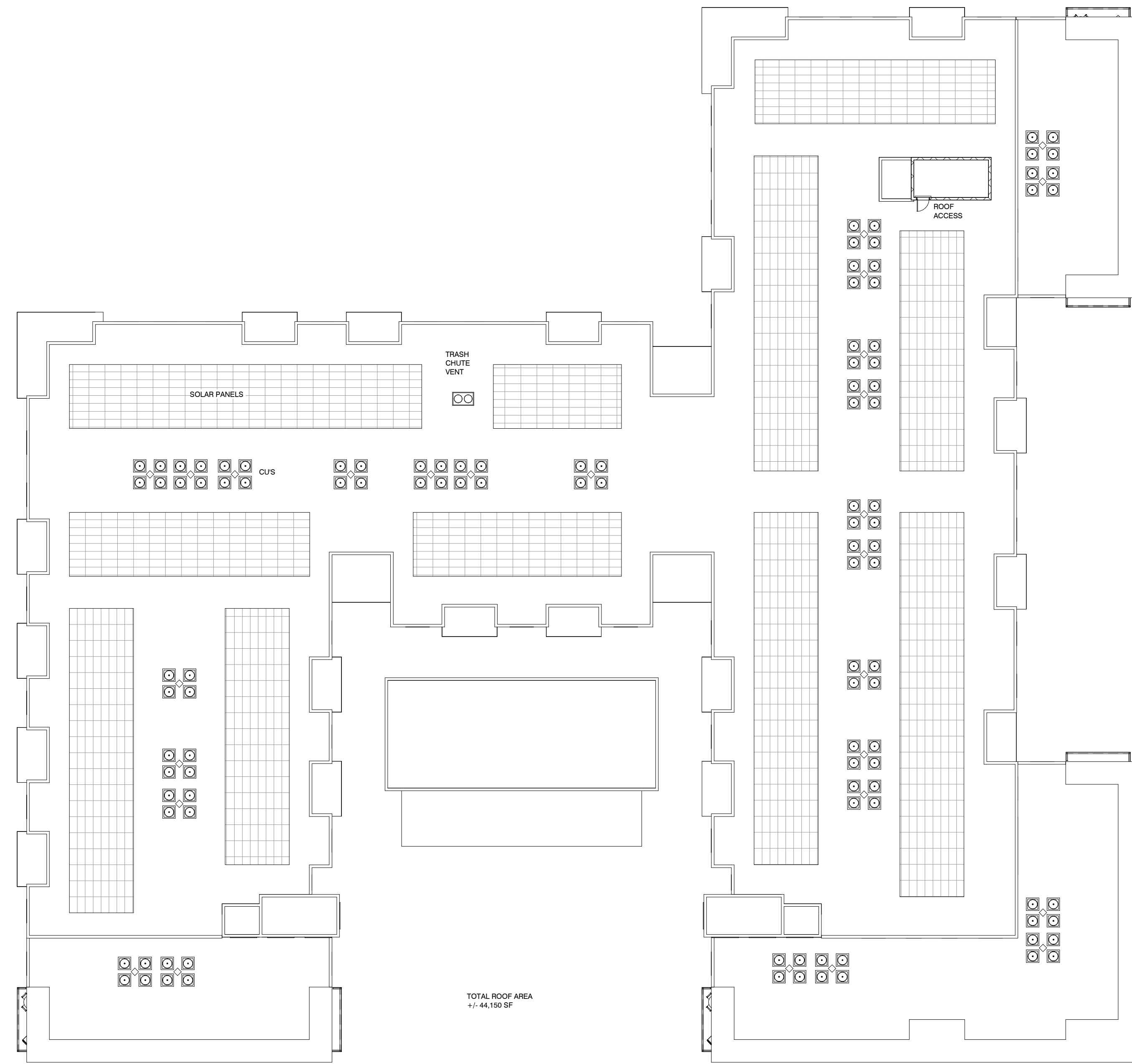
④ Roof Plan 1" = 20'-0"

SCALE: 0' - 1" = 30' - 0" 0' 15' - 0" 30' - 0" 60' - 0"