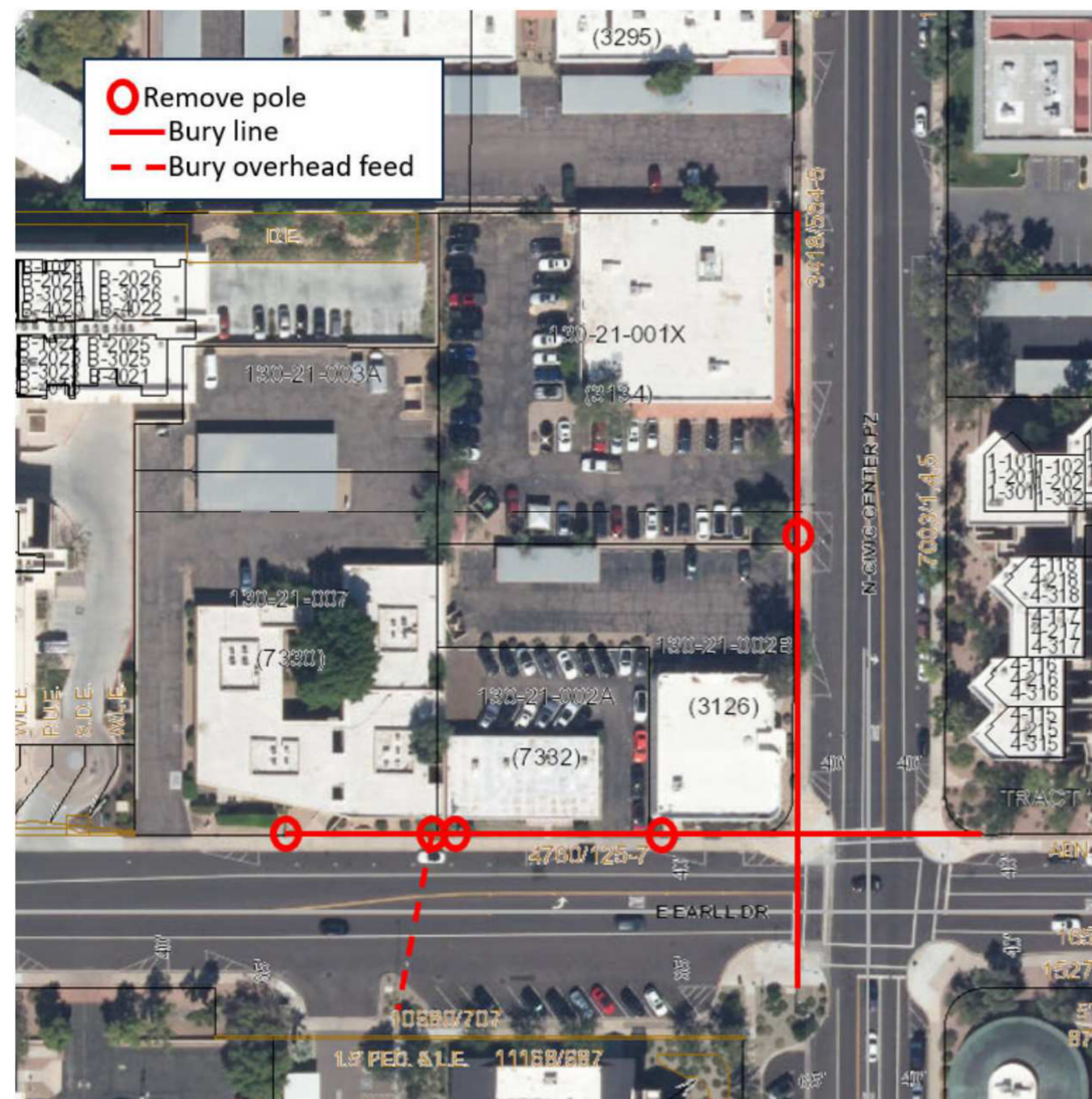
3 Site Plan - Removal and Undergrouning of Power Poles and Power Lines 1" = 80'-0"

K & I HOMES, LLC 6524 N 4TH STREET PHOENIX, AZ 85012 PH: 602-505-2525