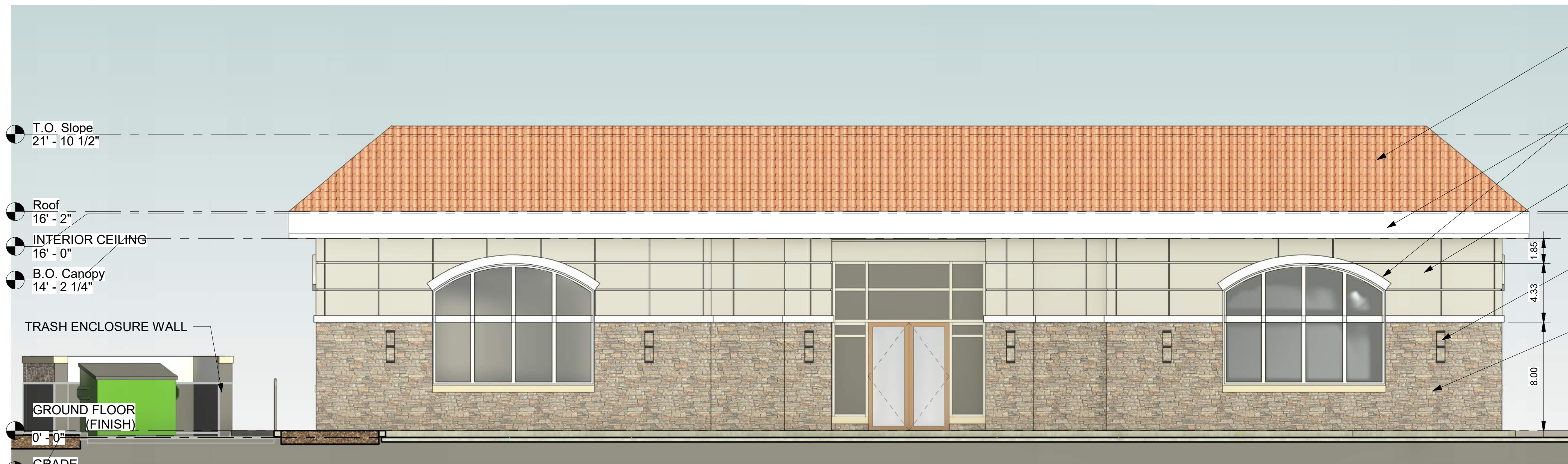
SOUTH- (FRONT) 3/16" = 1'-0"

TERRA COTTA ROOFING TO MATCH EXISTING FUEL CANOPY ROOF