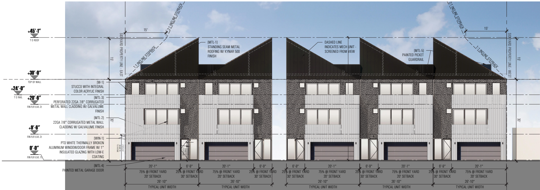
ELEVATION DIAGRAM - NORTH 2