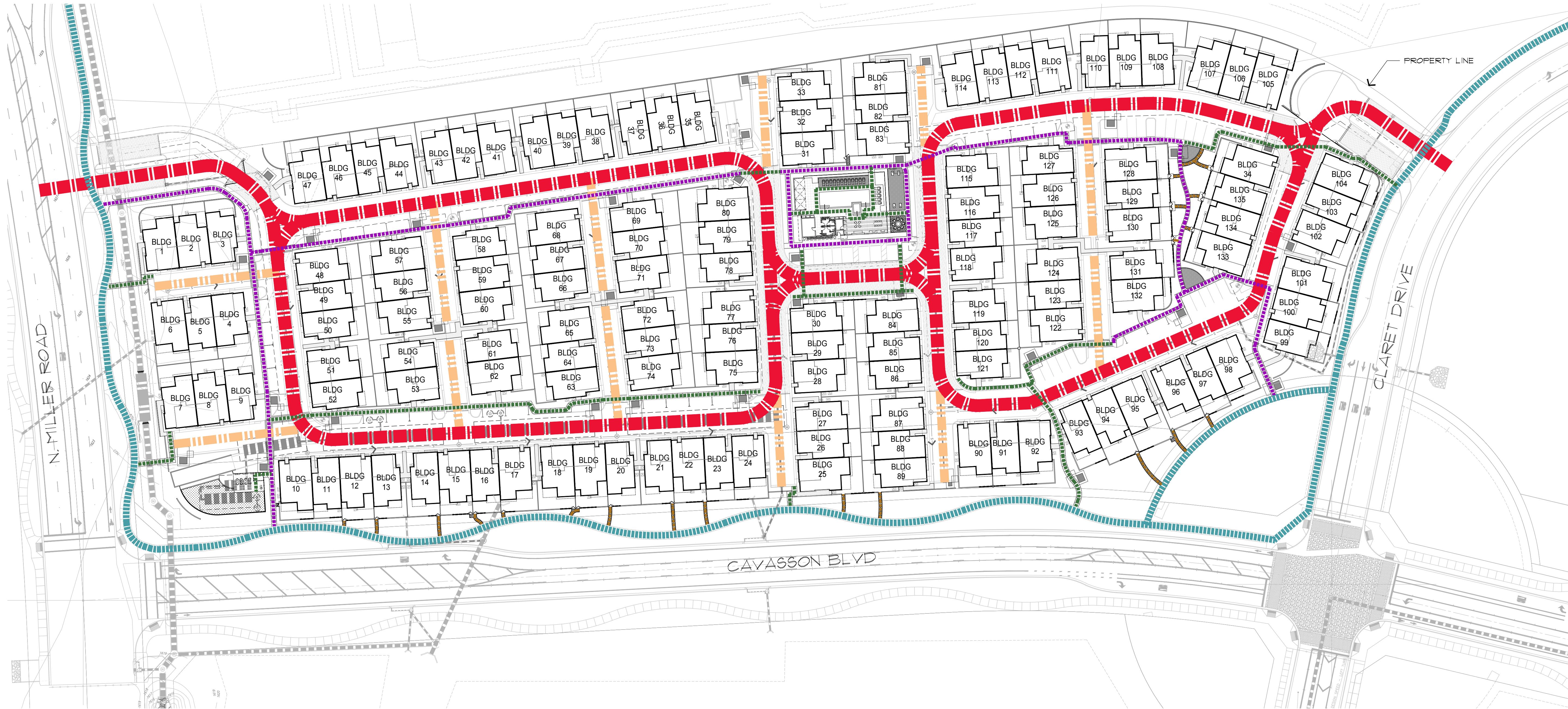
CONCEPTUAL CIRCULATION PLAN SCALE: 1"=50'-0" 0 25' 50' 100' NORTH