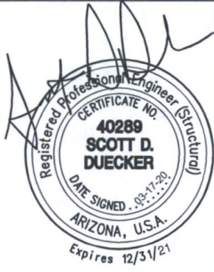
Seal, Signature & Date

This Electronic Signature Has Been Authorized By Me This March 17, 2020