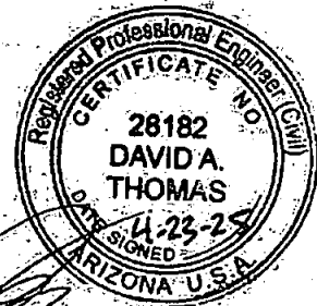
Seal, Signature & Date

I certify that, to the best of my knowledge, the requirements of the Building Code and the approved plans and specifications have been complied with, insofar as the portion of the work requiring special inspection under Section 1704 and 1705 is concerned, except for those deviations previously reported. A guarantee that the contractor necessarily constructed the building in full accordance with the plans and specifications is neither intended nor implied.