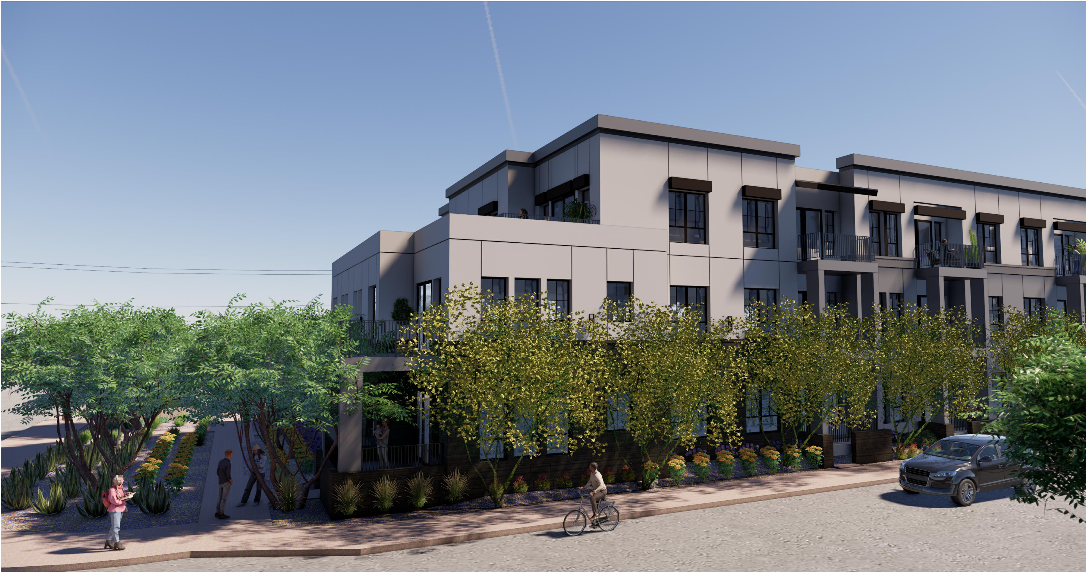
VIEW SOUTHEAST NEAR NORTH SIDE