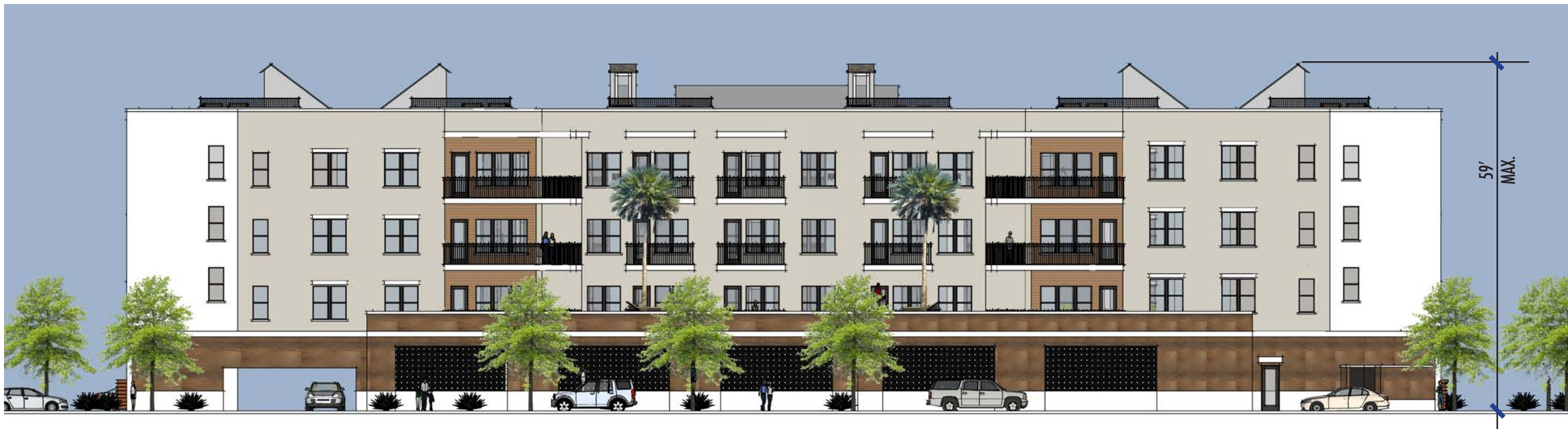
6TH STREET ELEVATION (NORTH)