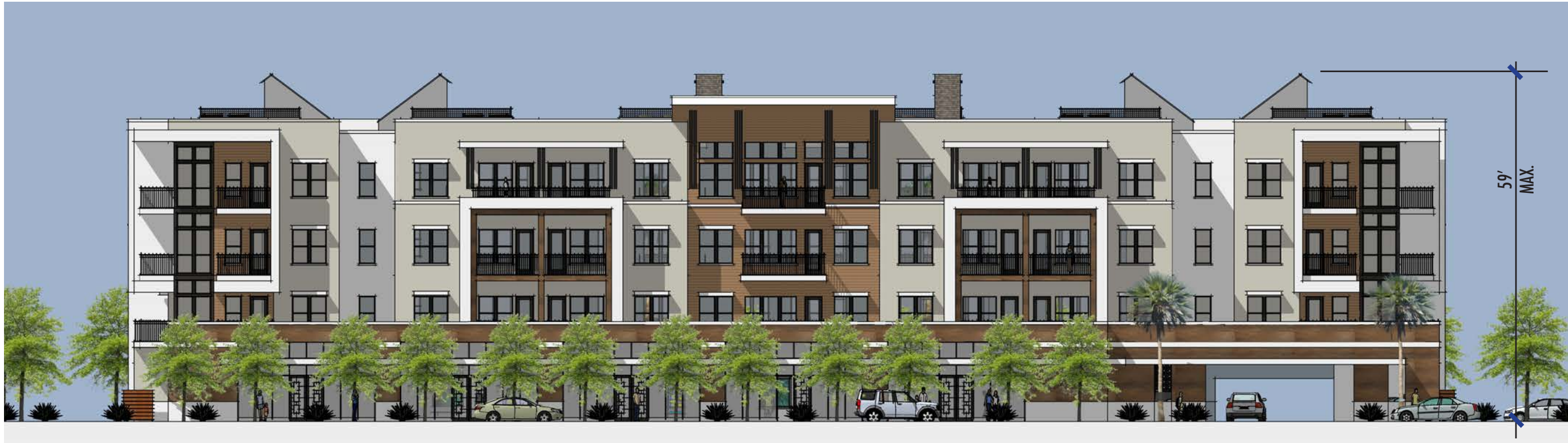
OSBORN ELEVATION (SOUTH)