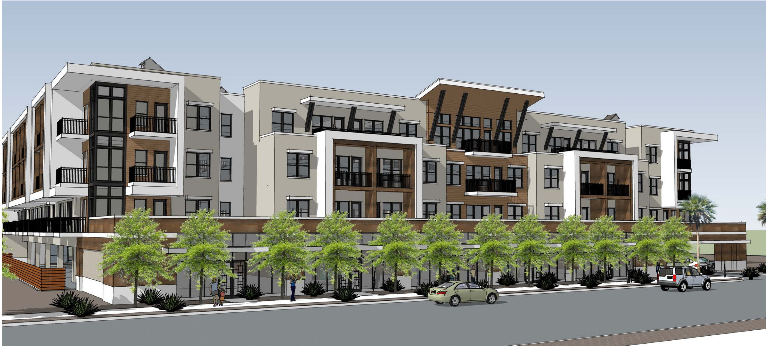
VIEW OF SOUTH ELEVATION (OSBORN ROAD)