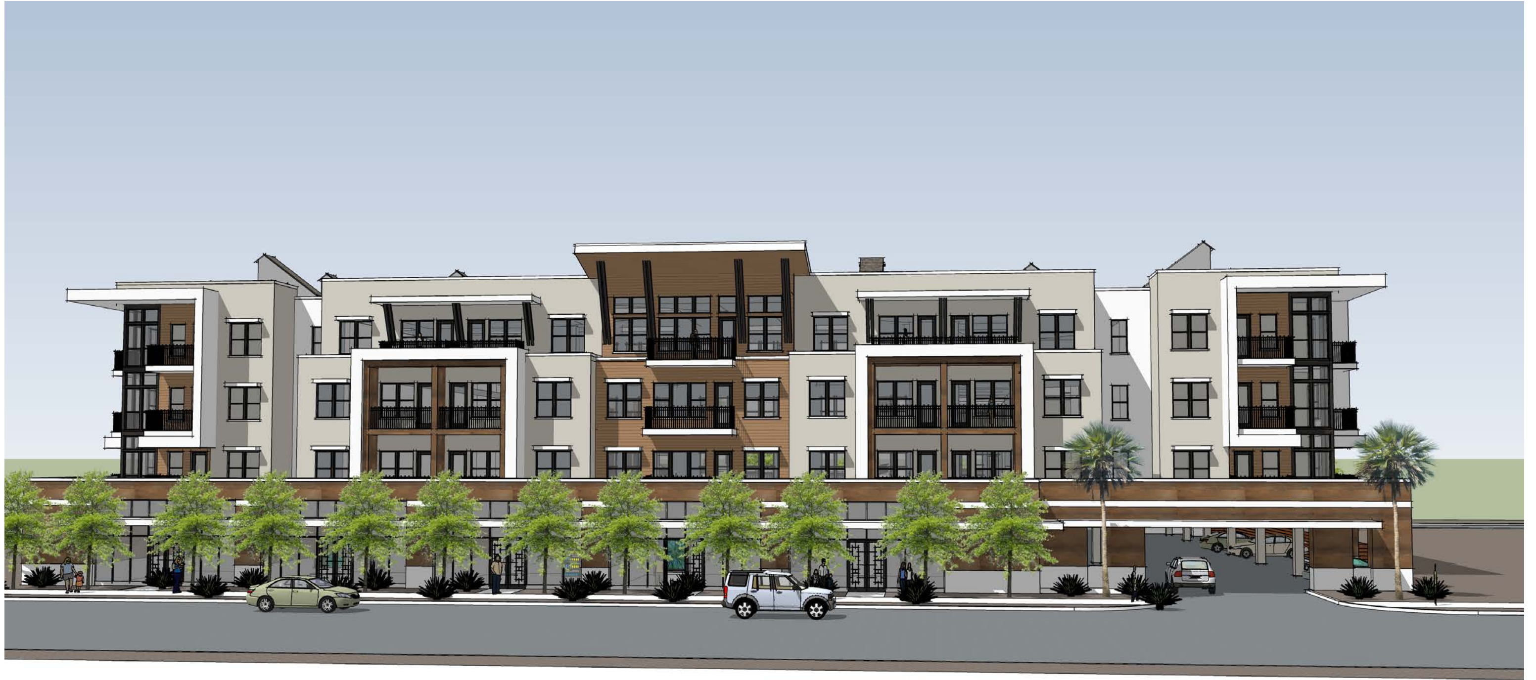
VIEW OF SOUTH ELEVATION (OSBORN ROAD)