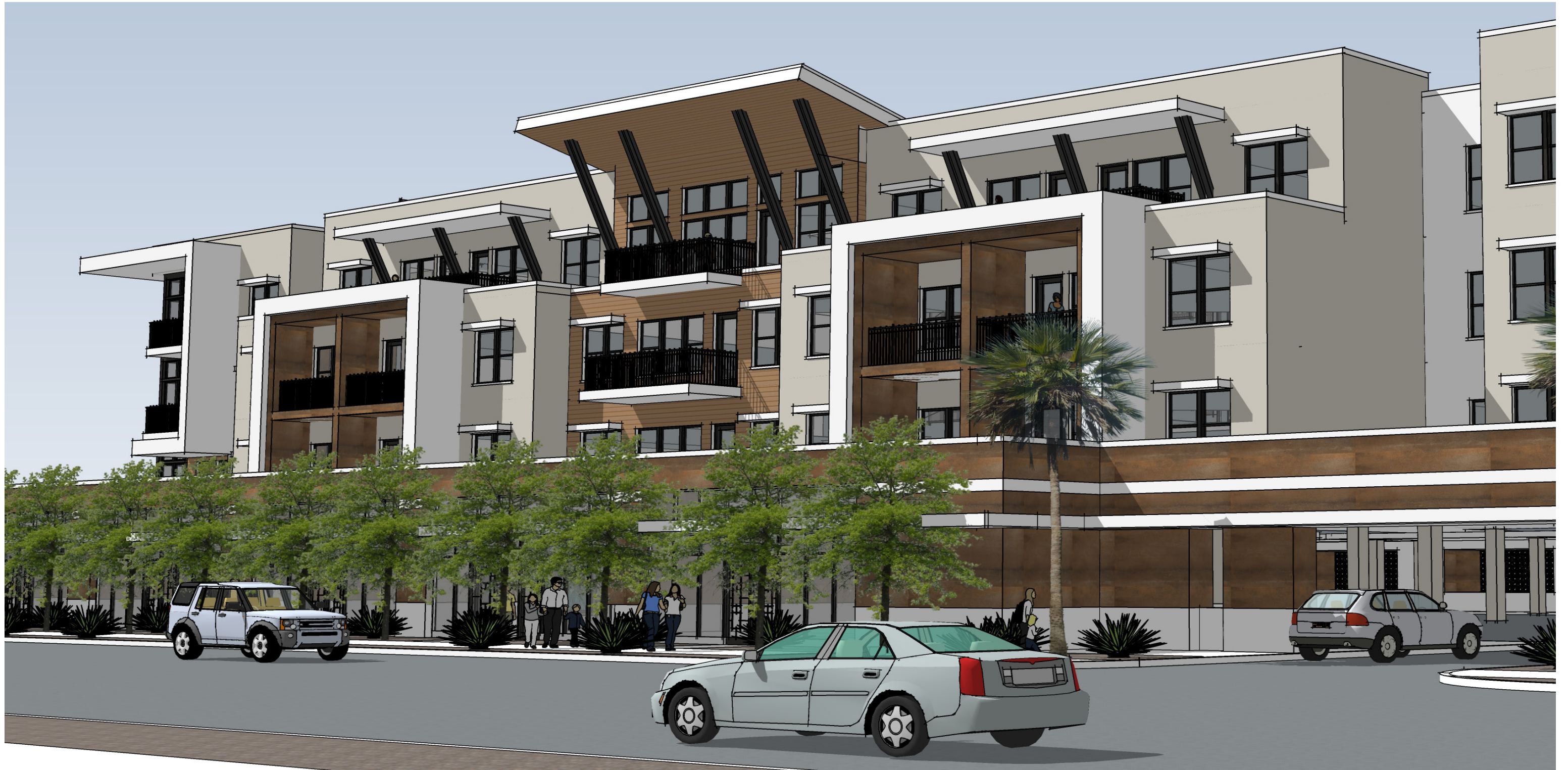
VIEW OF SOUTH ELEVATION (OSBORN ROAD)