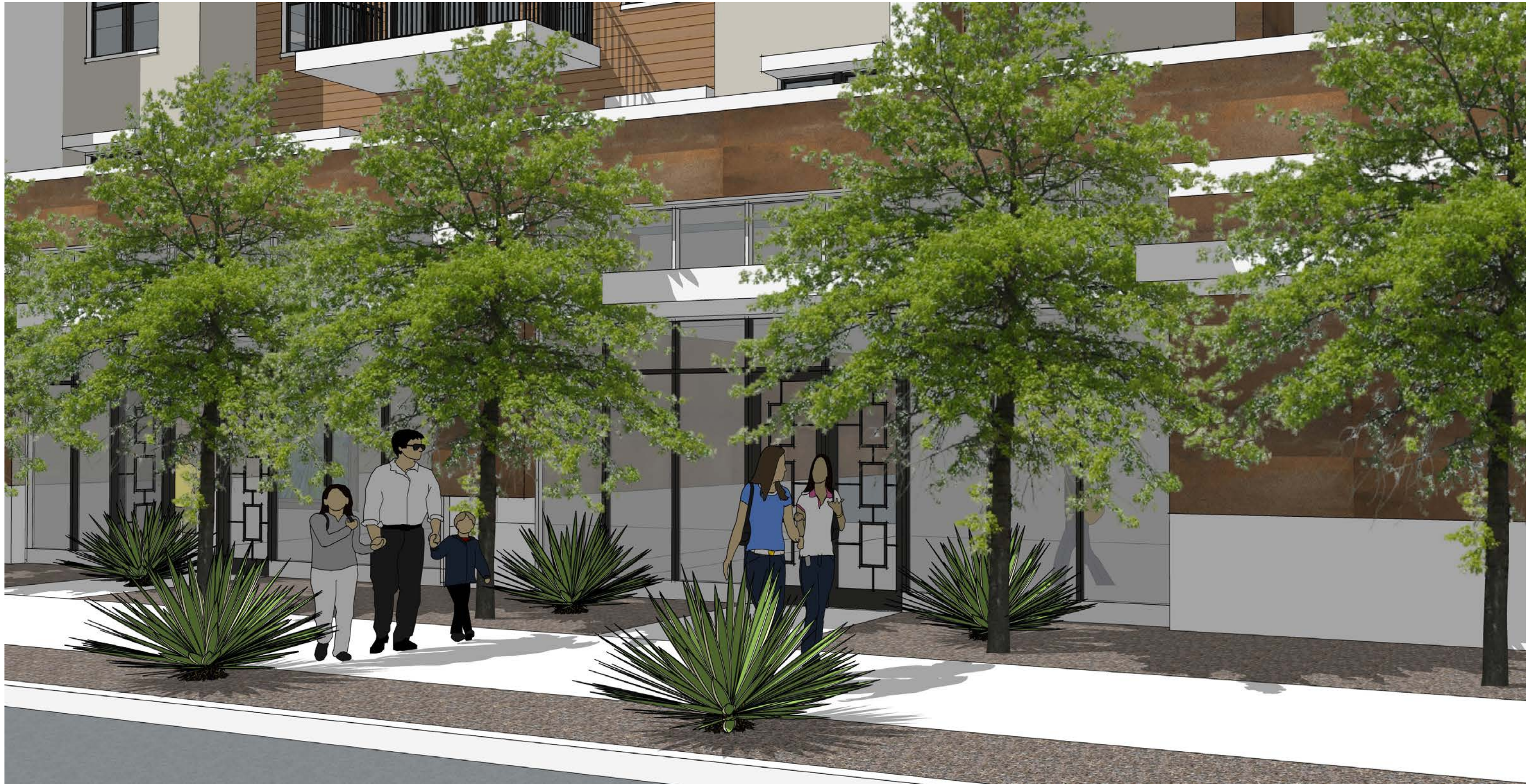
PEDESTRIAN EXPERIENCE ALONG OSBORN