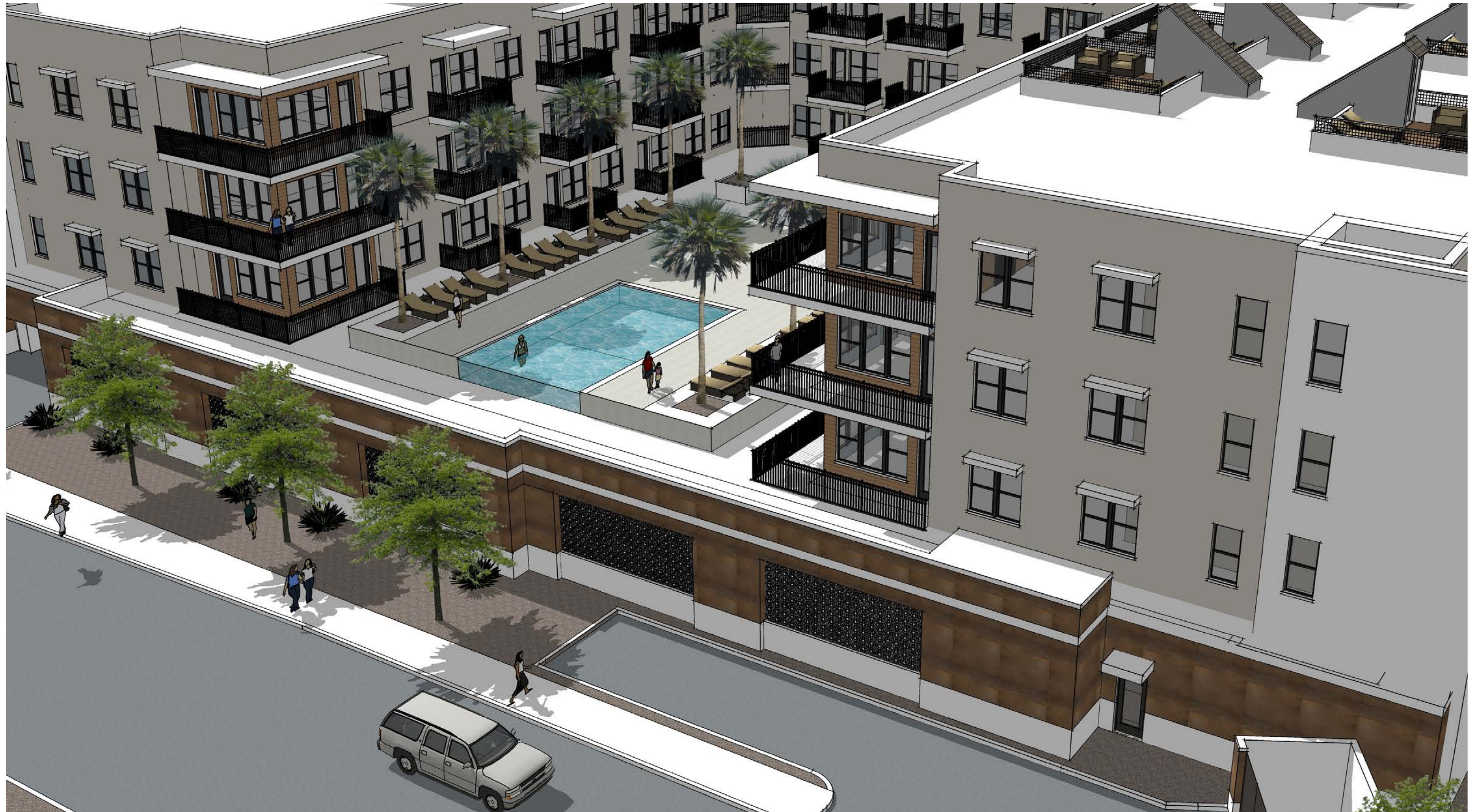
VIEW OF NORTH ELEVATION (6TH STREET)