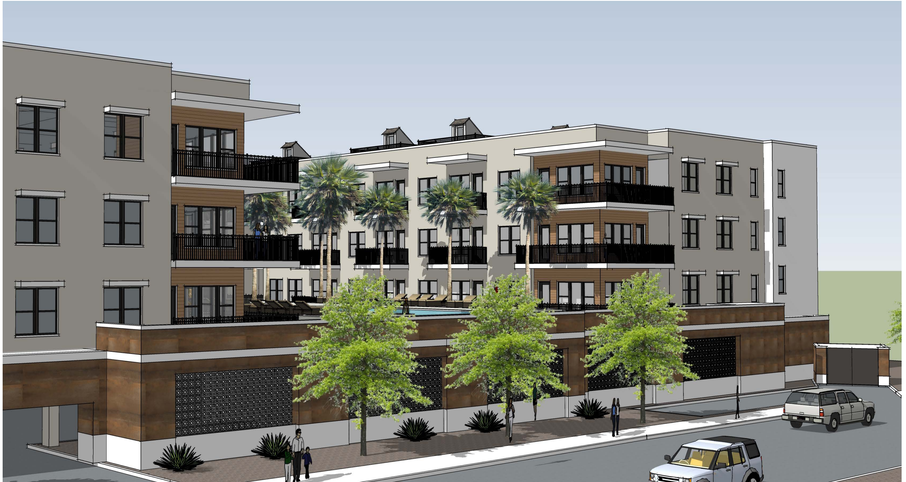
VIEW OF NORTH ELEVATION (6TH STREET)