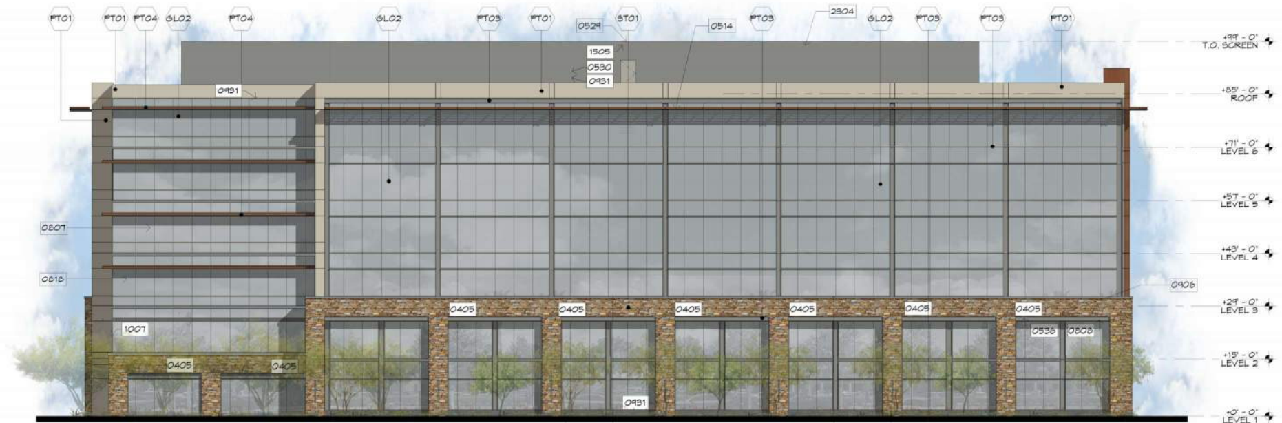
1 WEST ELEVATION SCALE: 1/16" = 1'-0"