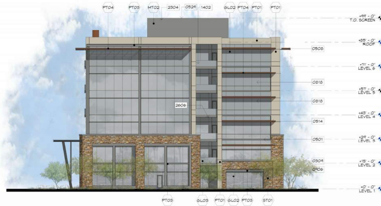
2 NORTH ELEVATION SCALE: 1/16" = 1'-0"