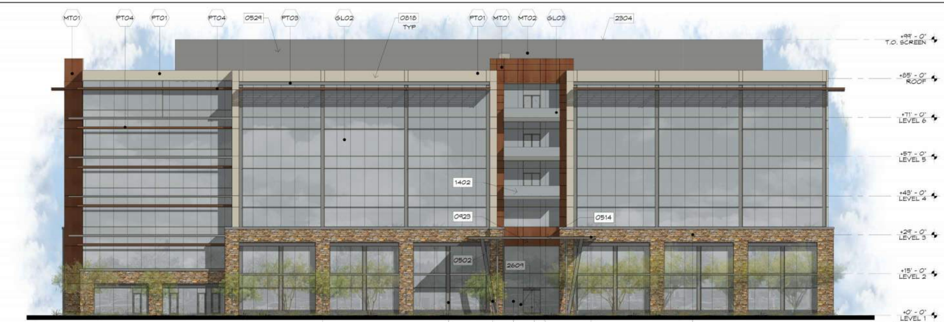
2 EAST ELEVATION SCALE: 1/16" = 1'-0"