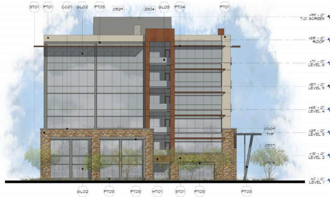
1 SOUTH ELEVATION SCALE: 1/16" = 1'-0"