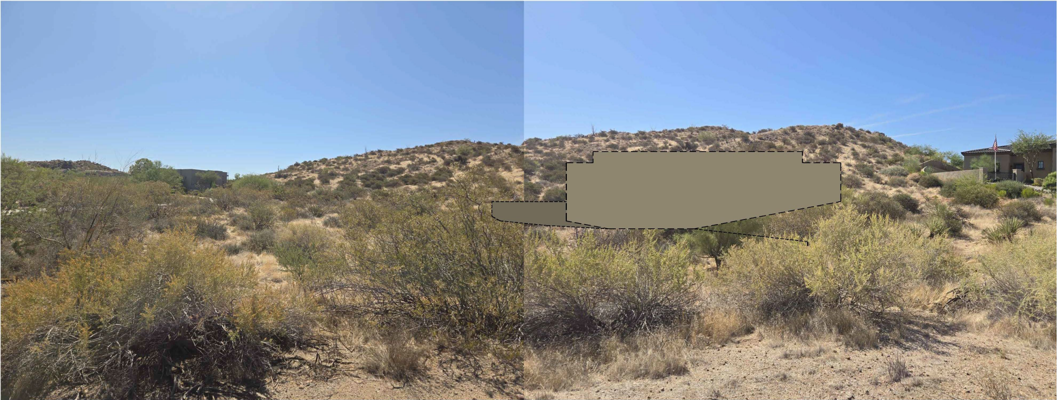
Angelone's proposed home location