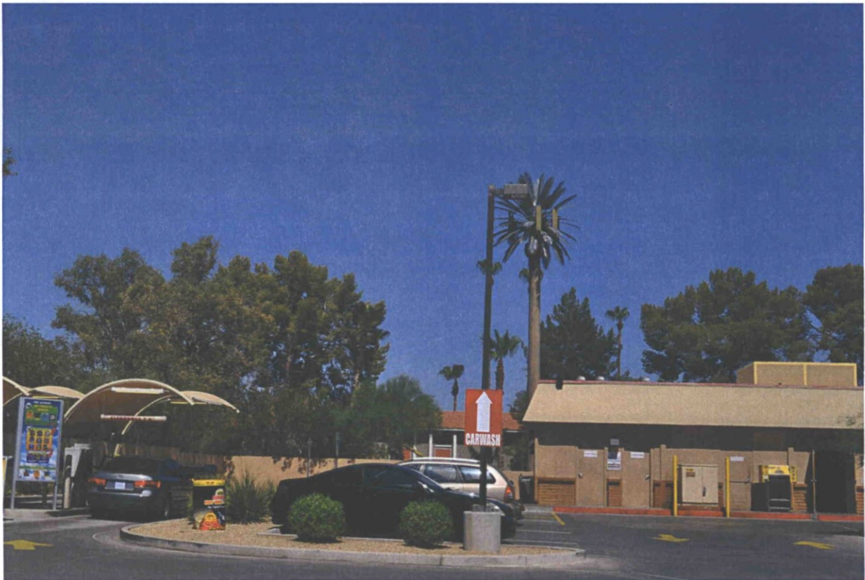
Looking South East