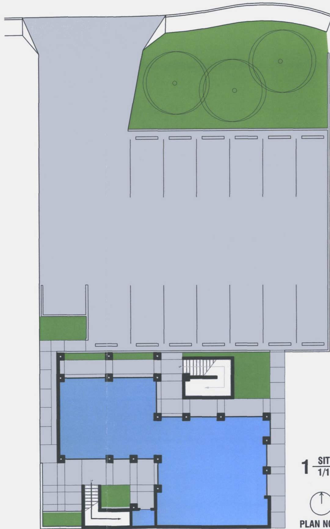
1 SITE MAP 1/16" = 12"