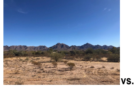
Example of the views of combined Lake/Mountain views from 6-10 zones