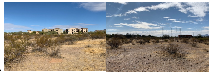
Examples of the views without pivoting the lake from Zone 1 – Apartment/Hotel View and Zone 2 - Storage/Powerline View Notice no mountain vistas

The Current Plan only allows for only two future design zones. We submitted a plan that moves the lake on a 45 degree angle which allows for up to 10 possible zones. Most importantly, the pivot allows for 5-6 zones to have a combined Lake