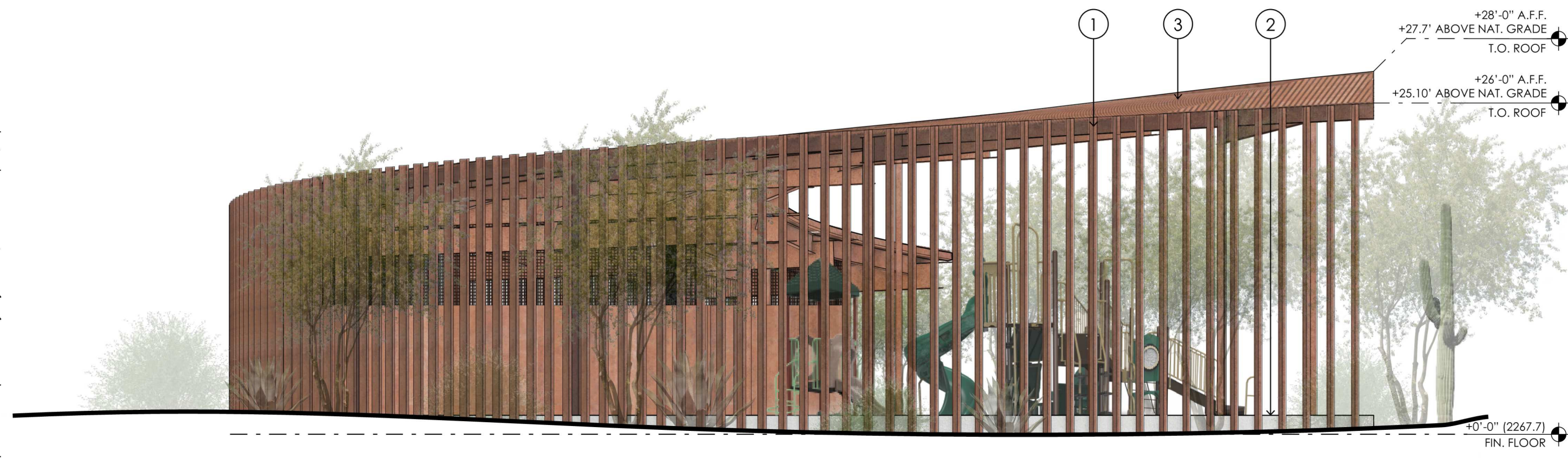
4 EAST ELEVATION SCALE: 1/8" = 1'-0"

This drawing is an instrument of service and the property of Floor Associates and shall remain their property. The use of this drawing shall be restricted to the original site for which it was prepared and publication thereof is expressly limited to such use. Reuse, reproduction or publication by any method, in whole or in part, is prohibited without written consent.