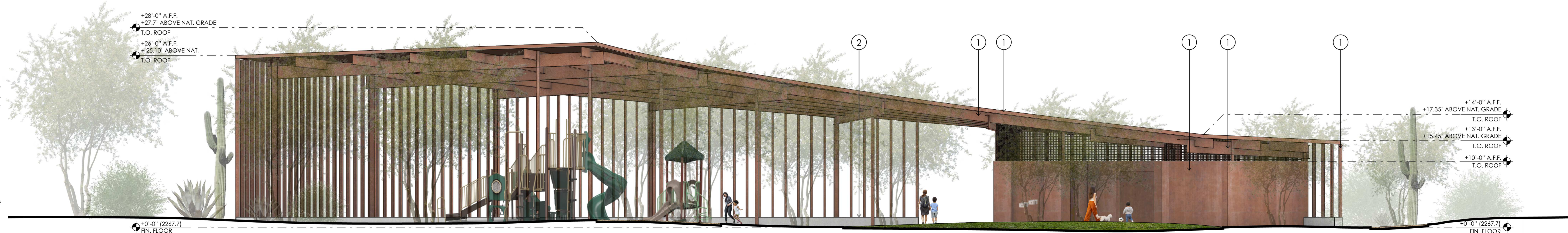
1 NORTH ELEVATION SCALE: 1/8" = 1'-0"