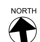
1 FIRST FLOOR OVERALL PLAN SCALE: 3/64" = 1'-0"