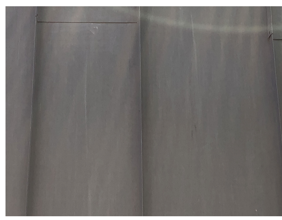
STANDING SEAM METAL ROOFS