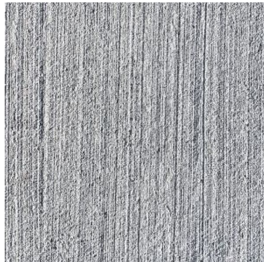
BROOM FINISH HARDY SURFACES WITH DYNAMIC SHADOW LINES