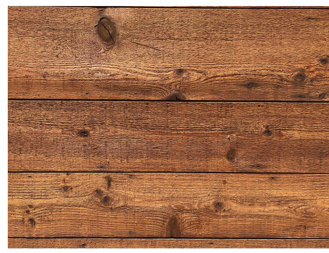
NATURAL OR FAUX WOOD SOFFITS