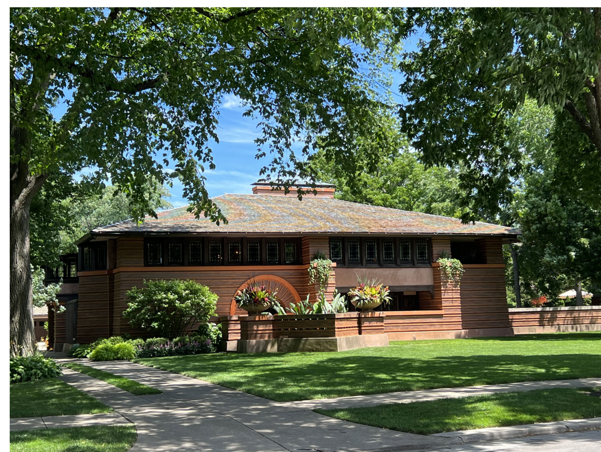
PITCHED ROOFS WITH LOW EAVES