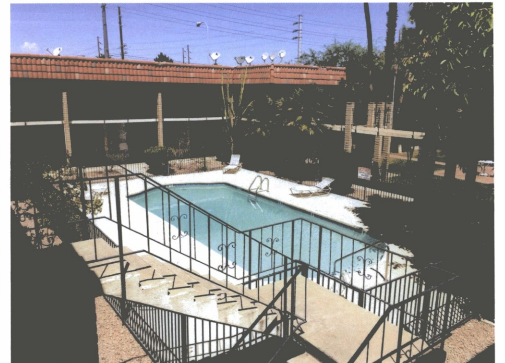
2 Existing Interior Courtyard