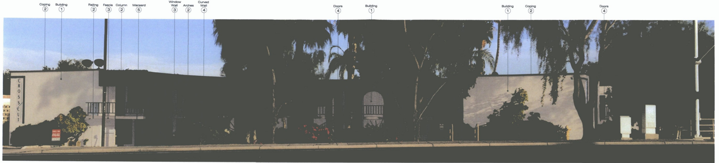
1 Proposed North Elevation