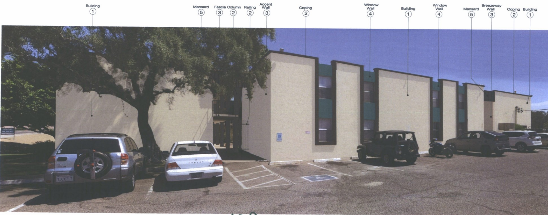
3 Proposed South Elevation