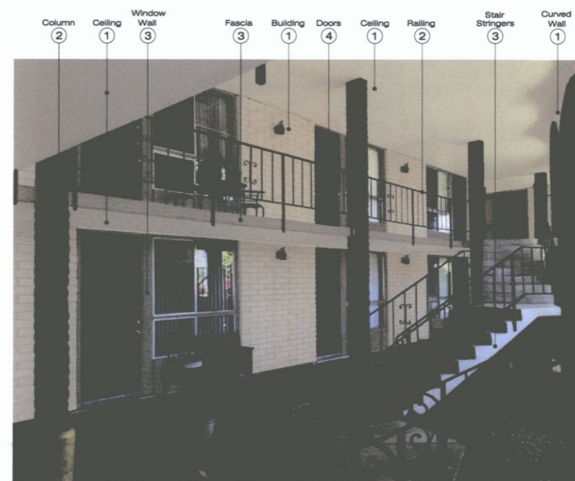
3 Proposed North Elevation Interior