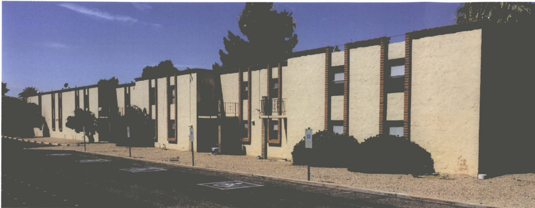
1 Existing East Elevation