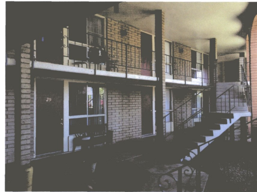
3 Existing North Elevation Interior