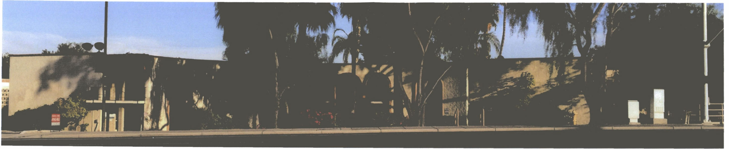
1 Existing North Elevation