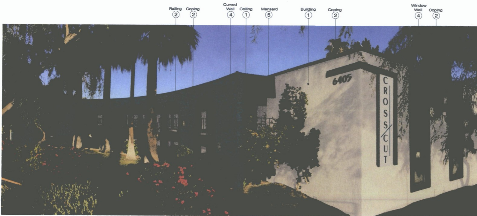
2 Proposed North West Elevation