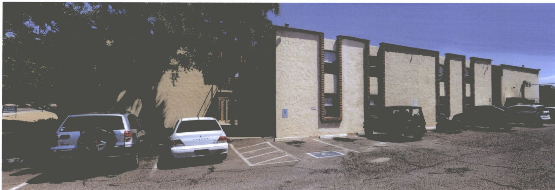
3 Existing South Elevation