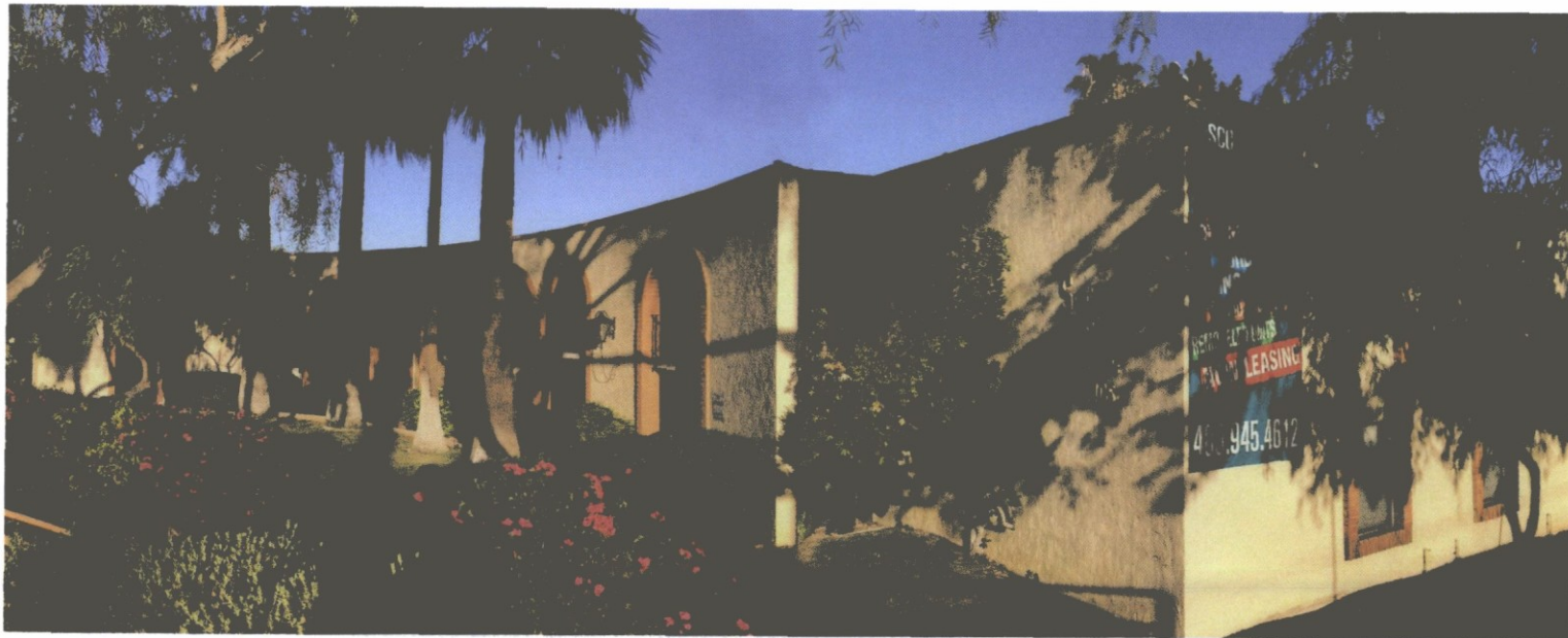
2 Existing North West Corner