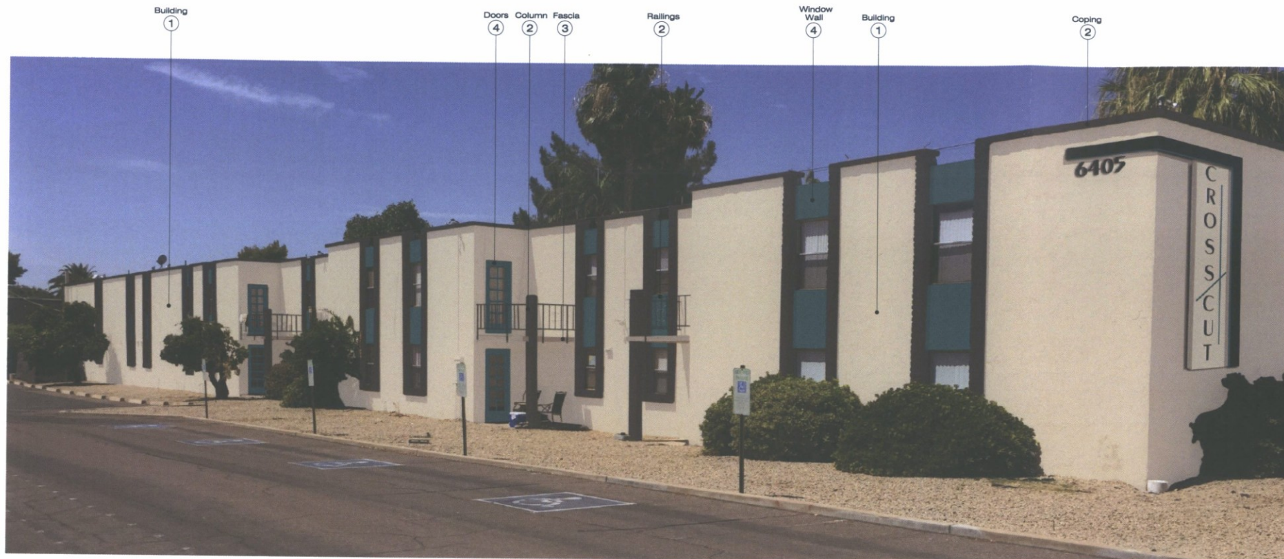
1 Proposed East Elevation