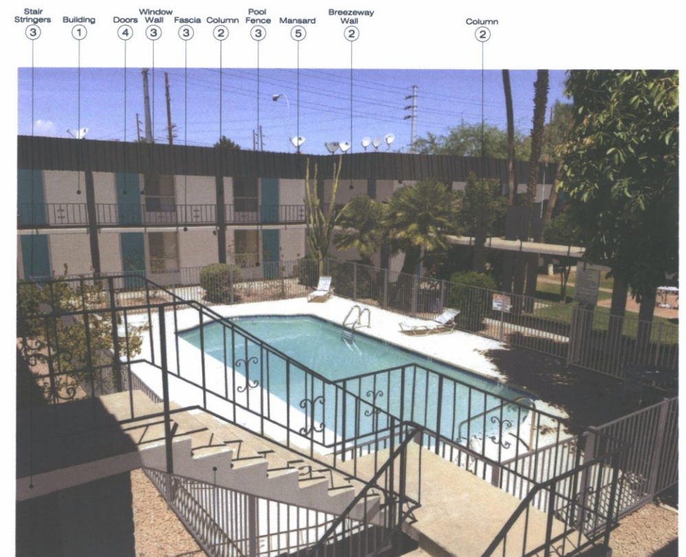
2 Proposed Interior Courtyard