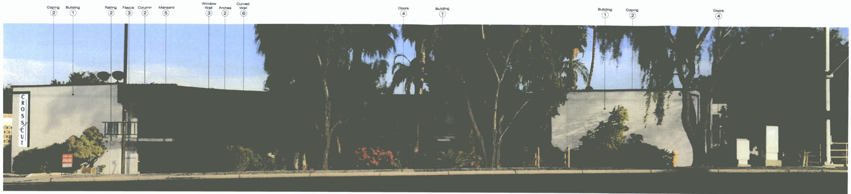
1 Proposed North Elevation