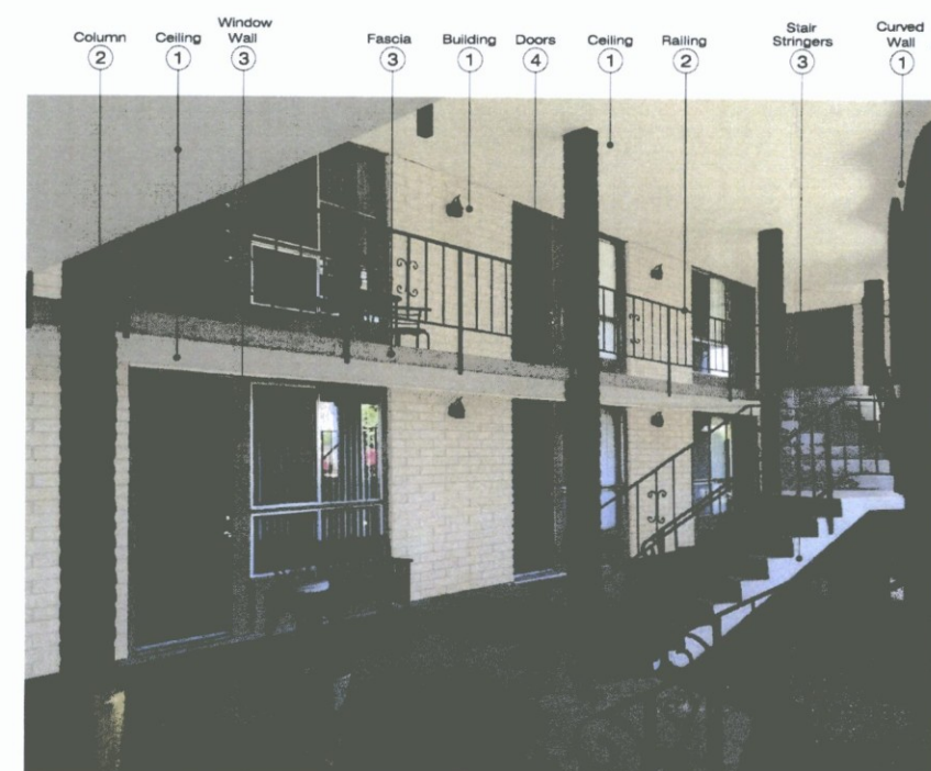
3 Proposed North Elevation Interior