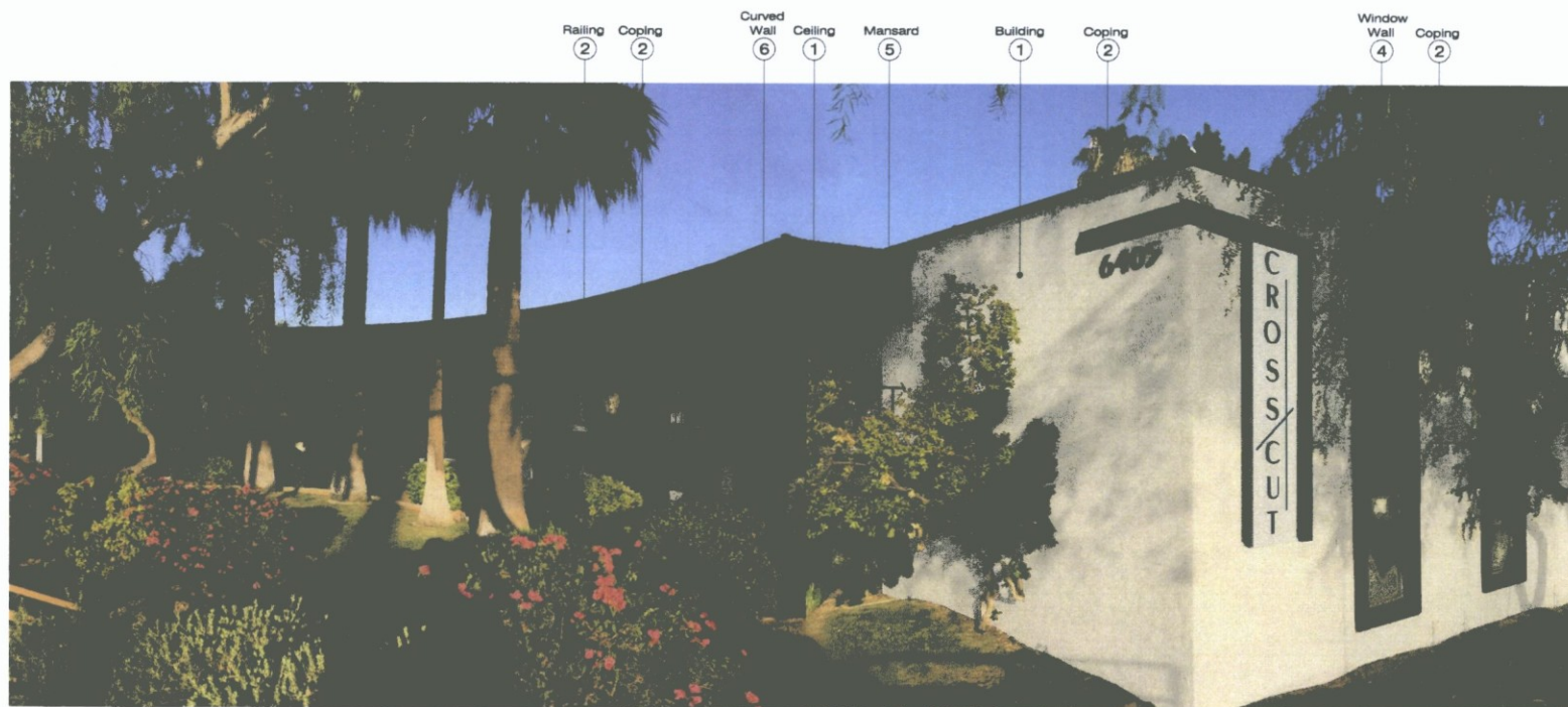
2 Proposed North West Elevation