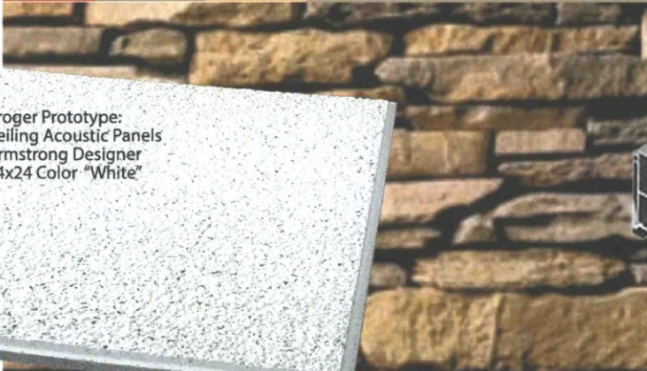
Owens Corning Cultured Stone