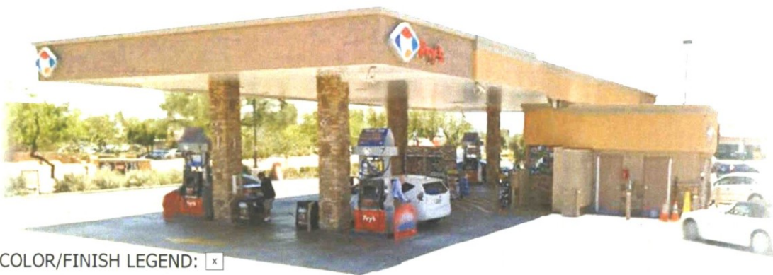
Existing Fuel Center Google Earth 2016 Street View