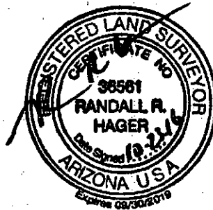
EXHIBIT "A" PHASE 1B STORYROCK

A PARCEL OF LAND LOCATED IN THE SOUTH HALF OF SECTION 1 AND NORTH HALF OF SECTION 12, TOWNSHIP 4 NORTH, RANGE 5 EAST OF THE GILA AND SALT RIVER BASE AND MERIDIAN, MARICOPA COUNTY, ARIZONA, BEING MORE PARTICULARLY DESCRIBED AS FOLLOWS: