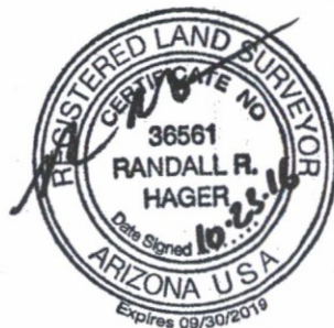
EXHIBIT "A" PHASE 1C STORYROCK

A PARCEL OF LAND LOCATED IN SECTION 12, TOWNSHIP 4 NORTH, RANGE 5 EAST OF THE GILA AND SALT RIVER BASE AND MERIDIAN, MARICOPA COUNTY, ARIZONA, BEING MORE PARTICULARLY DESCRIBED AS FOLLOWS: