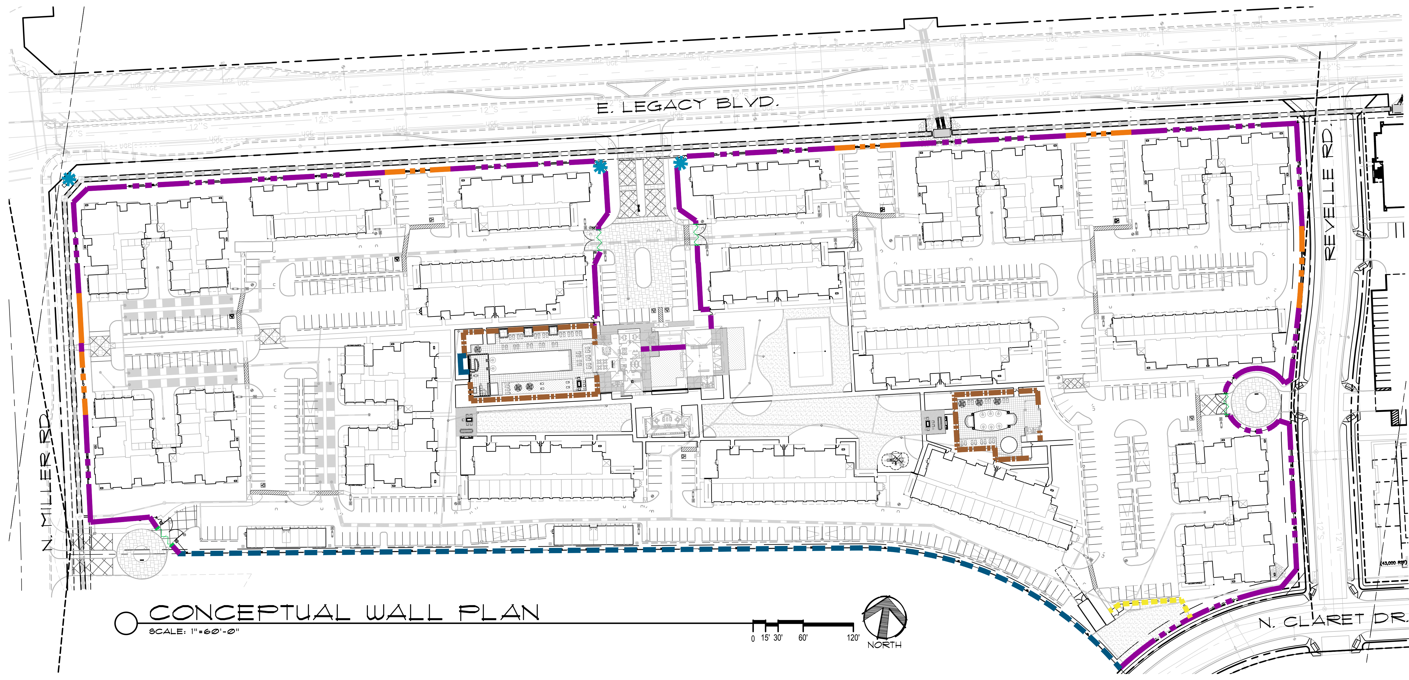
CONCEPTUAL WALL PLAN SCALE: 1"=60'-0"

FILE: /Users/collaborative3/collaborative V Dropbox/Landscape/Inland/Residential/CH/Residences at Cavasson - WALL CP.dwg USER: collaborative3 DATE: Jun, 16 2021 TIME: 03:16 pm