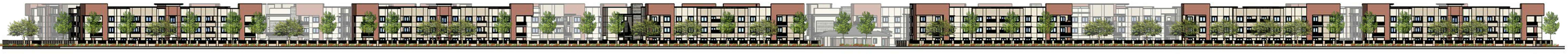
3 STREET ELEVATION LEGACY BOULEVARD SCALE: 1" = 50'