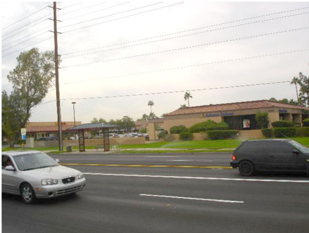
VIEW FROM HAYDEN ROAD