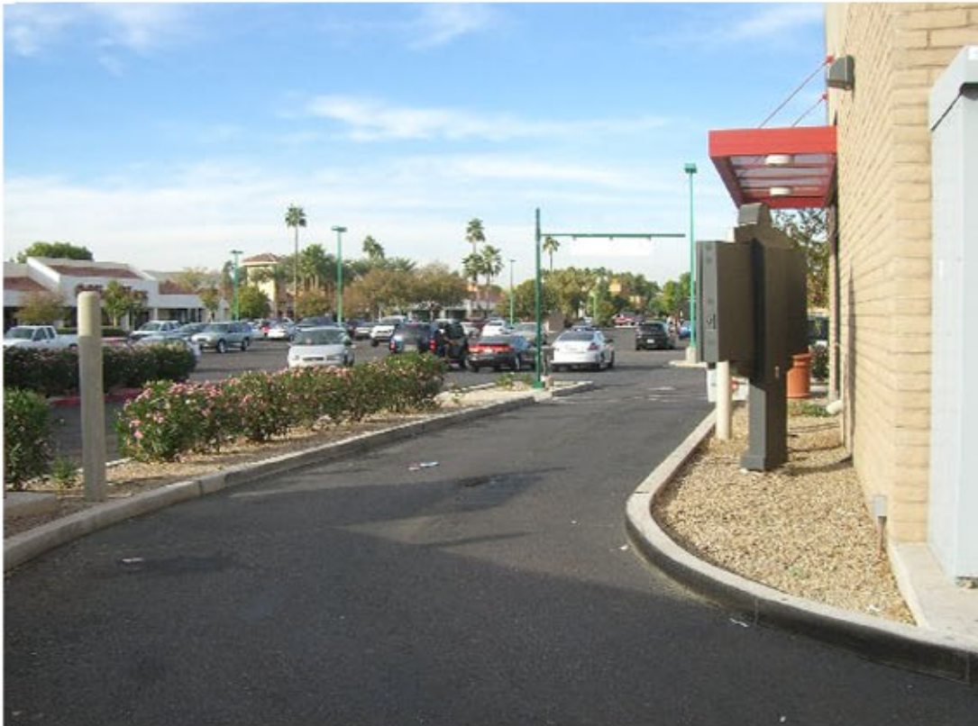
VIEW FROM STARBUCKS DRIVE THRU AREA