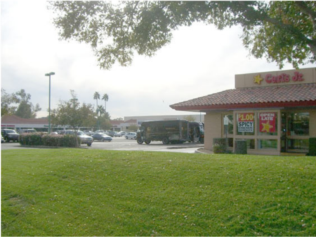
CARL'S JR. LOOKING SOUTHWEST FROM PAD BLDG.