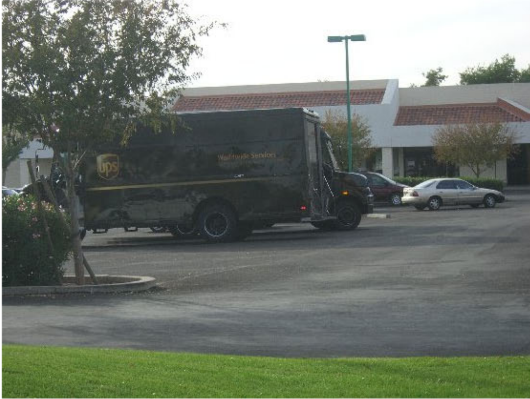
OFFICEMAX AREA BLOCKED BY TRUCKS.