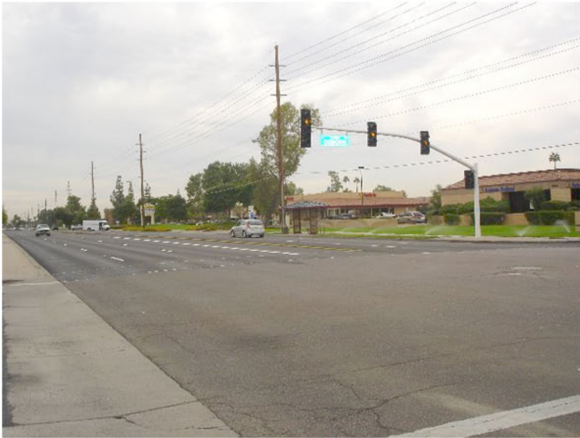
VIEW FROM CORNER OF HAYDEN AND OSBORN