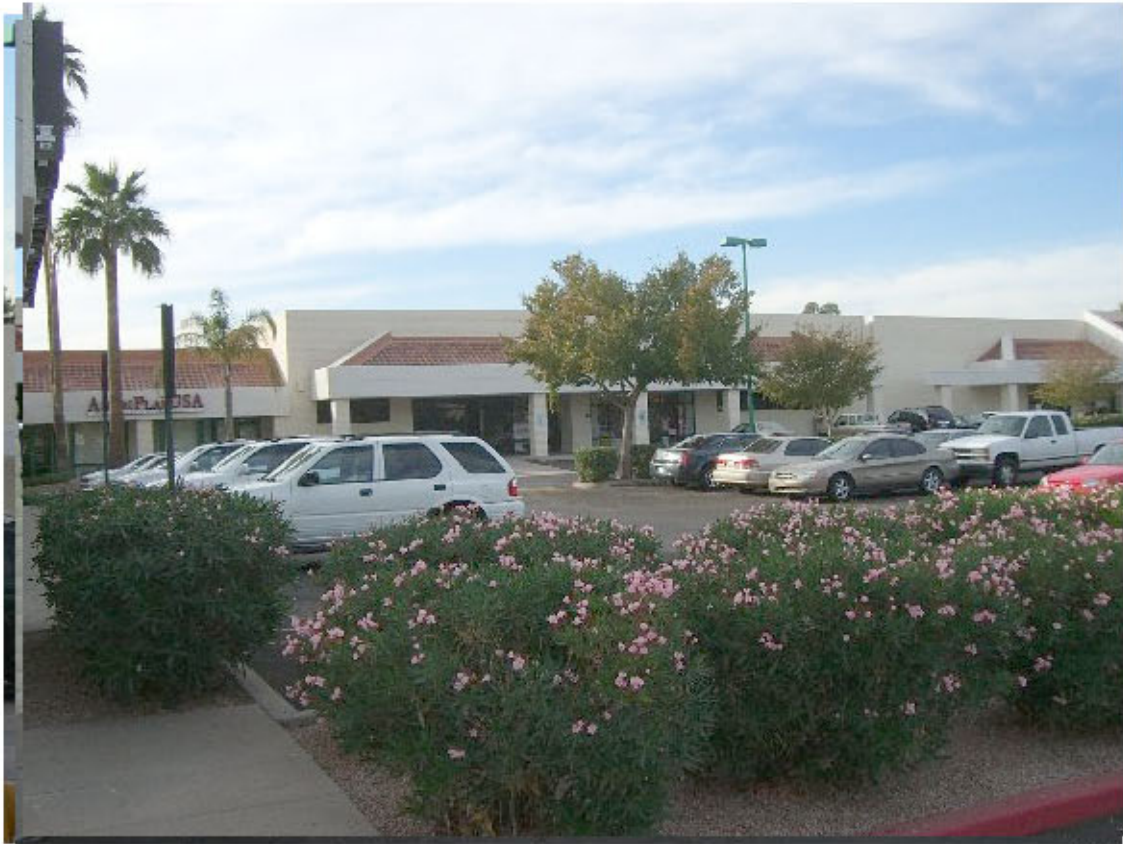
VIEW FROM HAYDEN NEAR OSBORN ROAD FEDERAL CREDIT & CARL'S JR. OFFICEMAX & BIG5 NOT SEEN