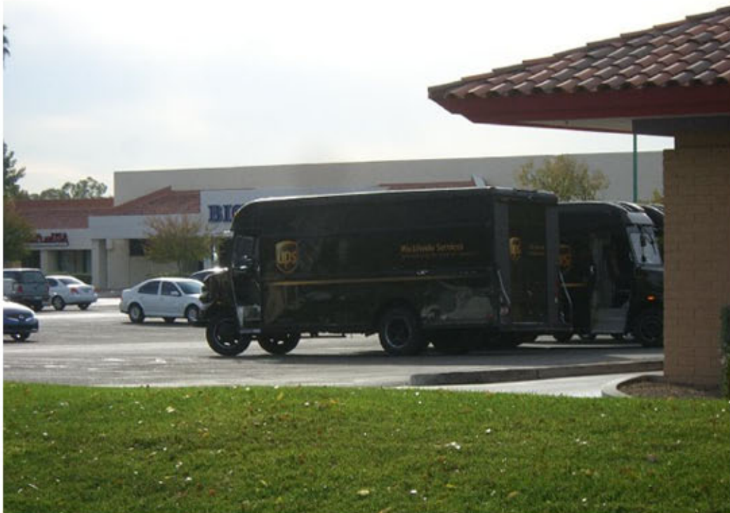
BIG5 AREA BLOCKED BY TRUCKS