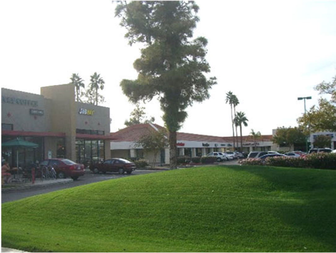
STARBUCKS/SUBWAY NEW BLDG. FACADE VERY HIGH