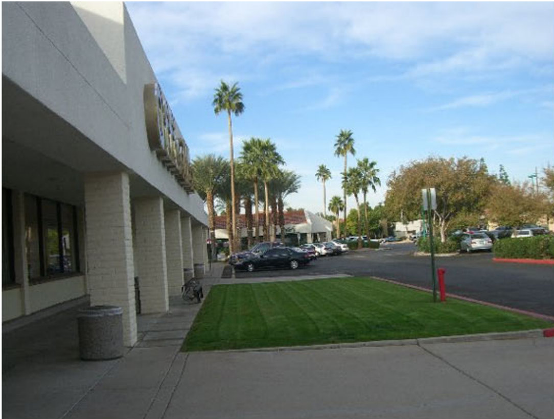
OFFICEMAX CANOPY/WALKWAY LOOKING NORTH