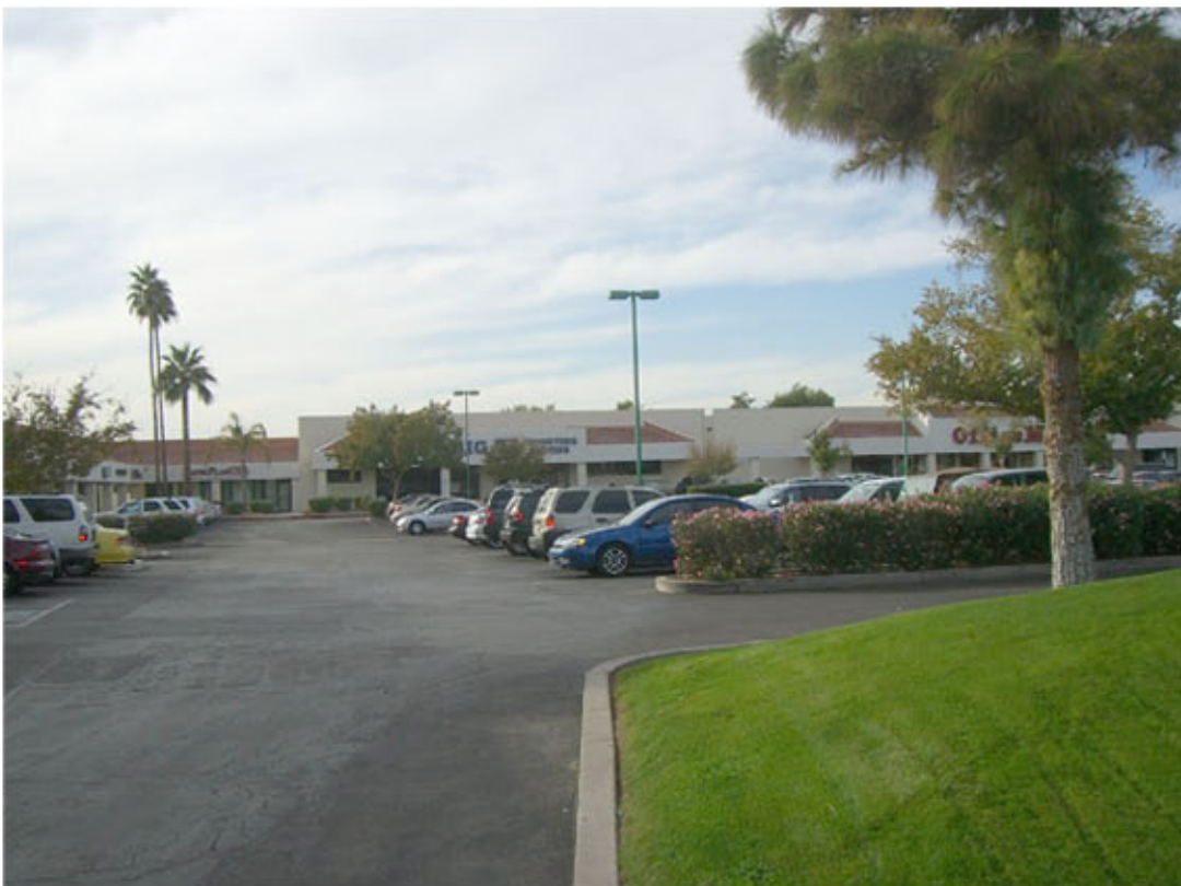
LOOKING WEST FROM HAYDEN ROAD