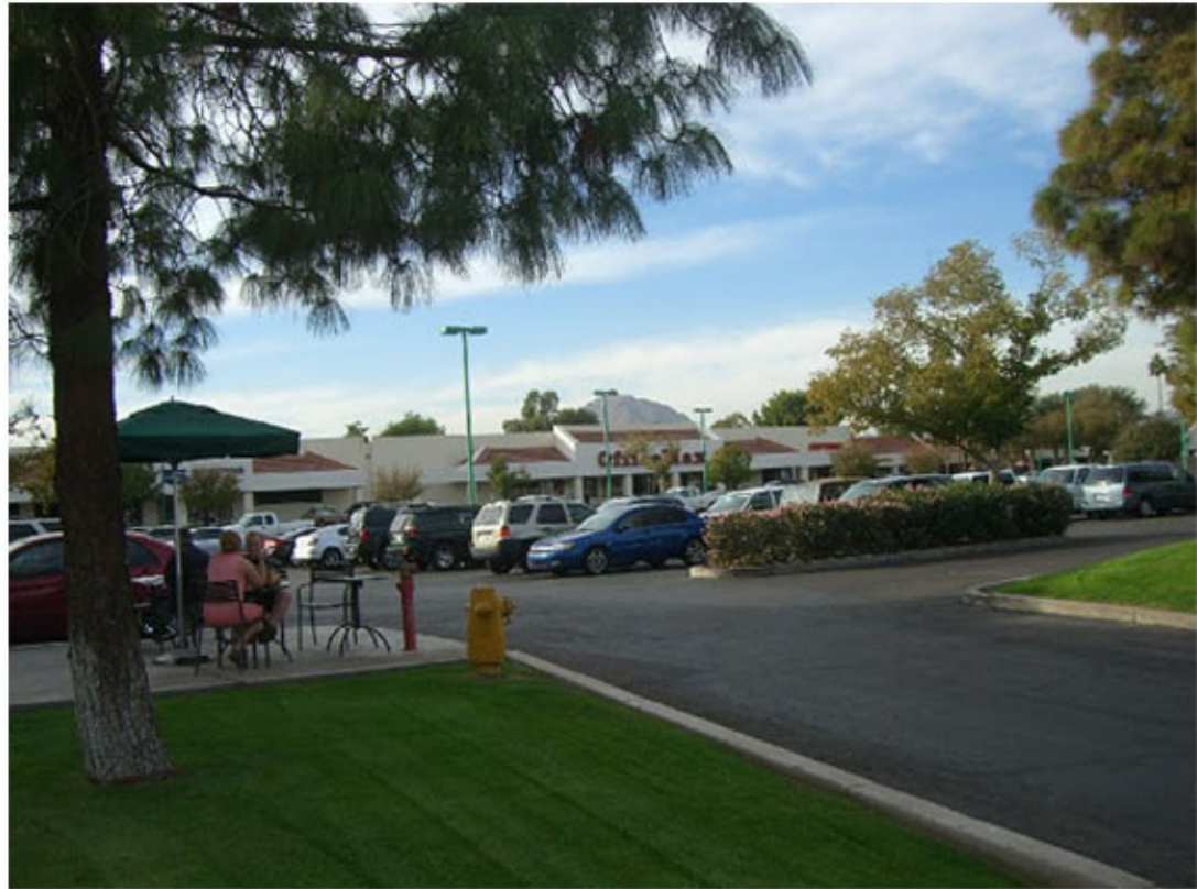
OFFICEMAX LIGHTS AND TREES, BOTH IN FRONT AND THE REAR ARE HIGHER THAN OFFICEMAX.