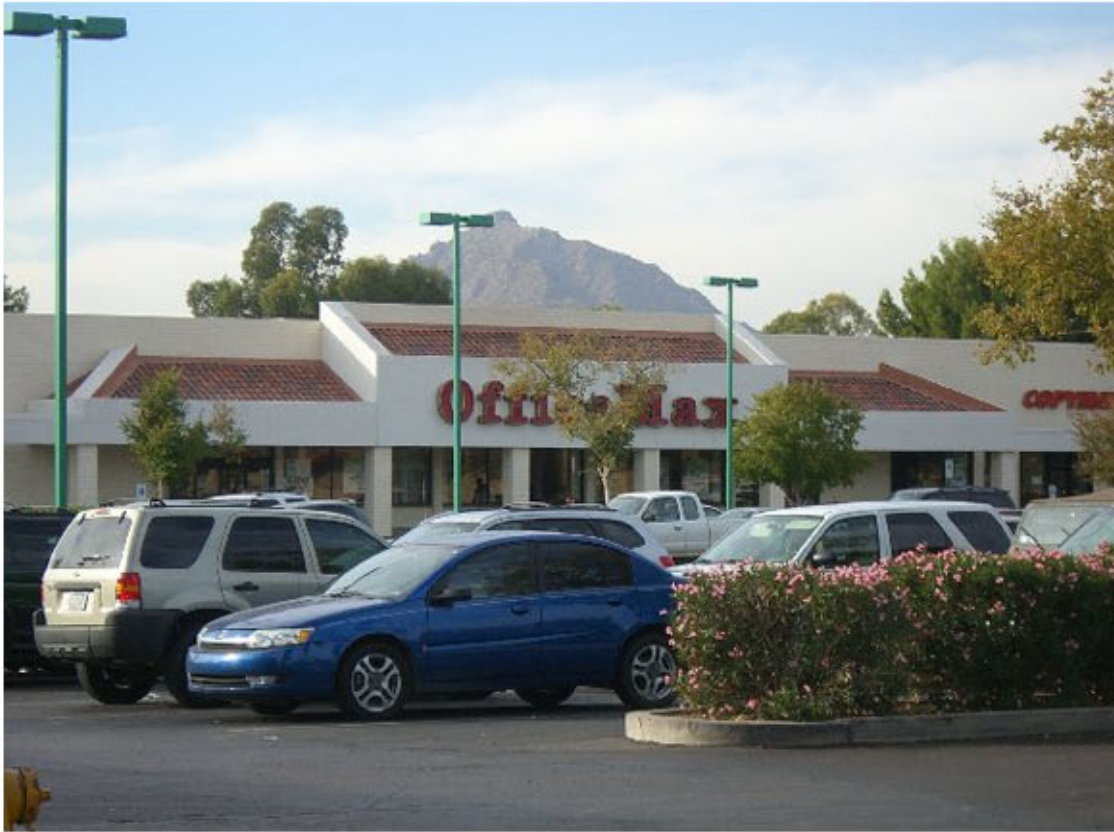
VIEW FROM STARBUCKS DRIVE THRU AREA