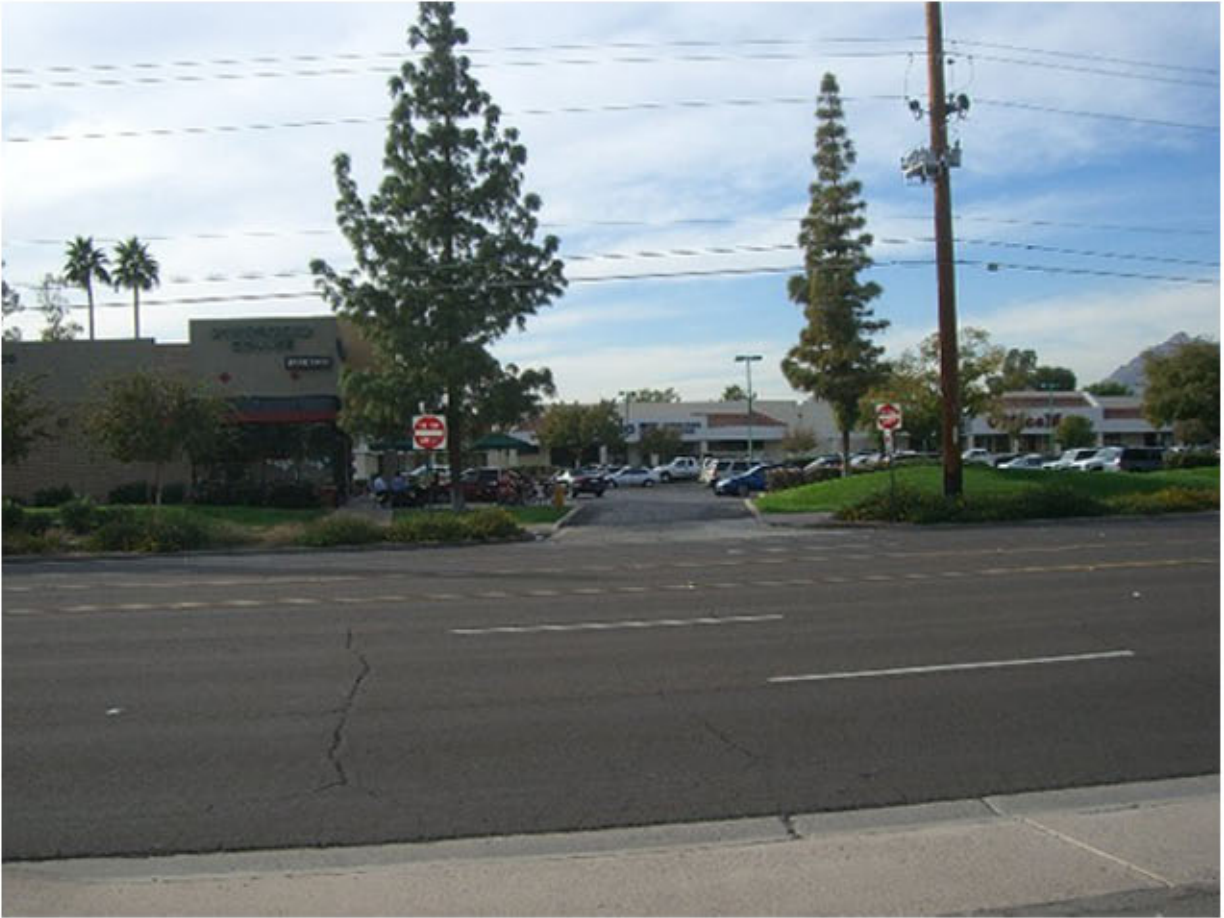
STARBUCKS PAD LOOKING FROM HAYDEN ROAD SIDEWALK