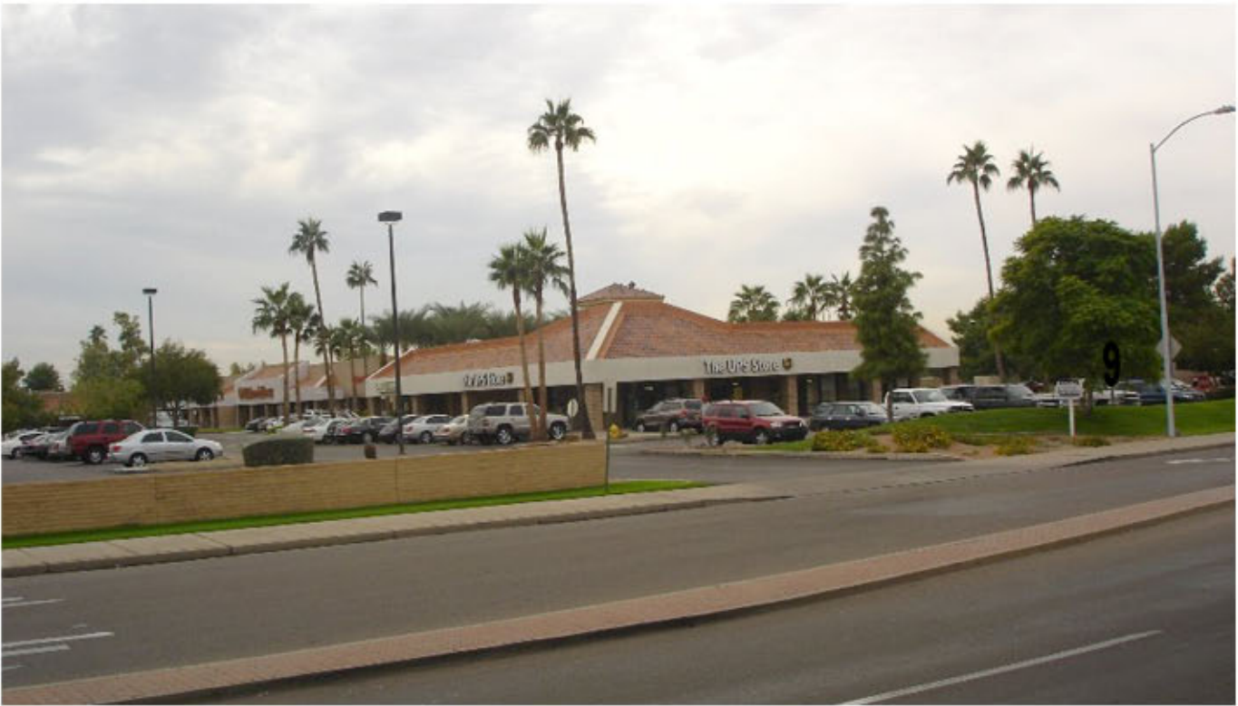
LOOKING SOUTHWEST FROM OSBORN ROAD