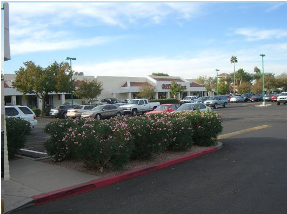
VIEW FROM STARBUCKS DRIVE THRU AREA