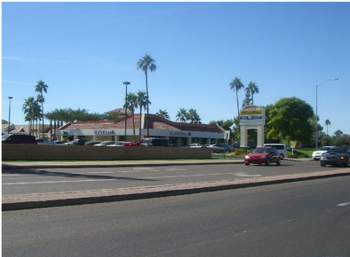
VIEW FROM OSBORN