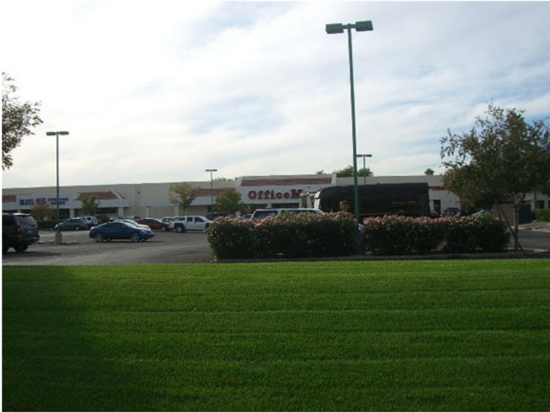
VIEW FROM HAYDEN ROAD SIDEWALK