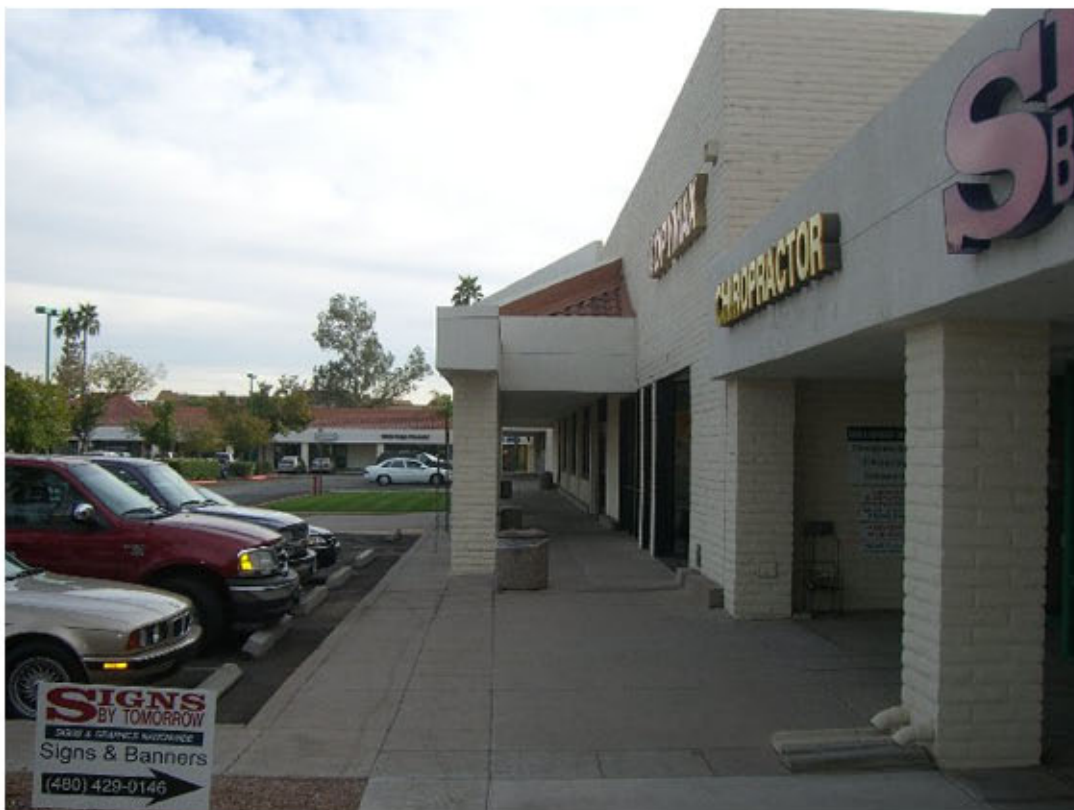
CANOPY/WALKWAY LOOKING SOUTH