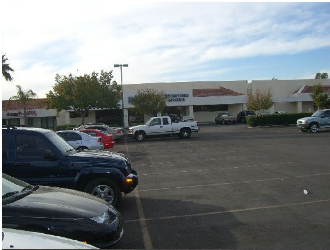
VIEW FROM PARKING LOT