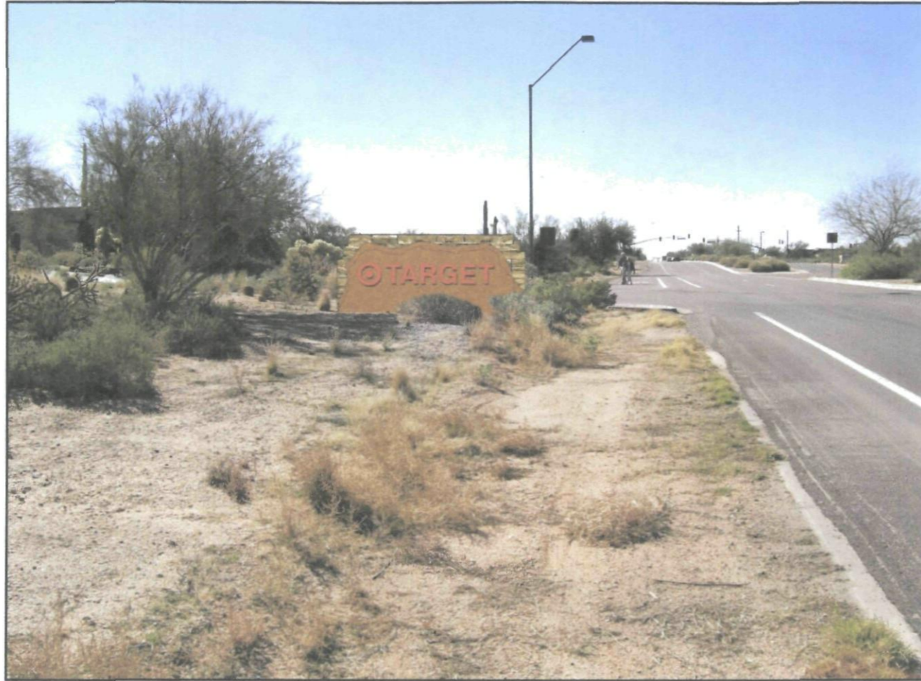
South Bound Scottsdale Road