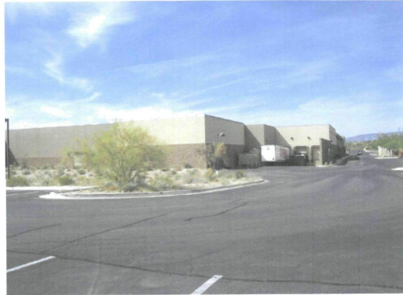
Right elevation, right side