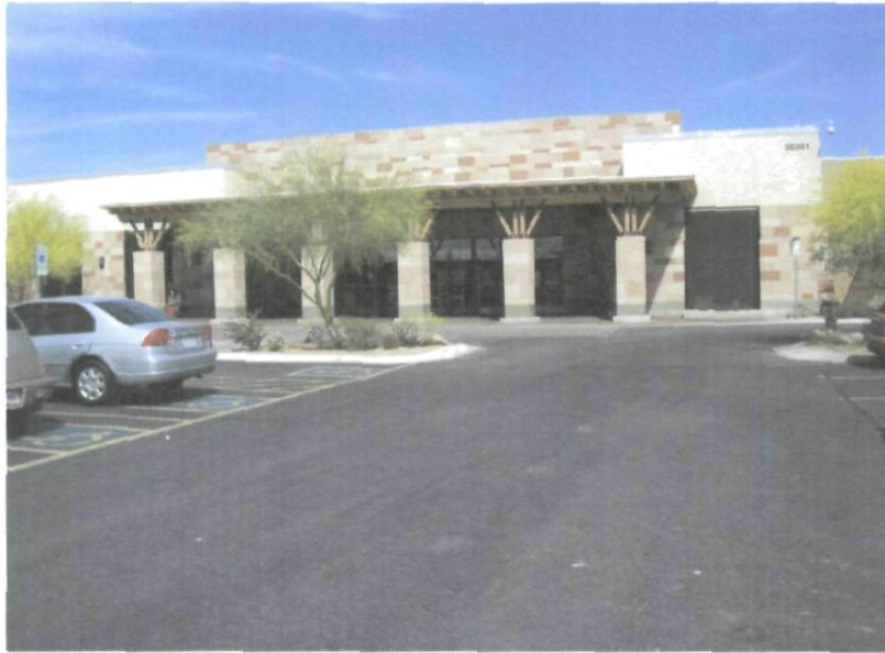
Front elevation, store front 24' to top of parapet