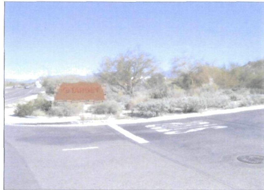
North Bound Scottsdale Road