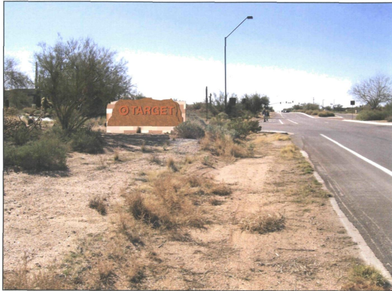
South Bound Scottsdale Road