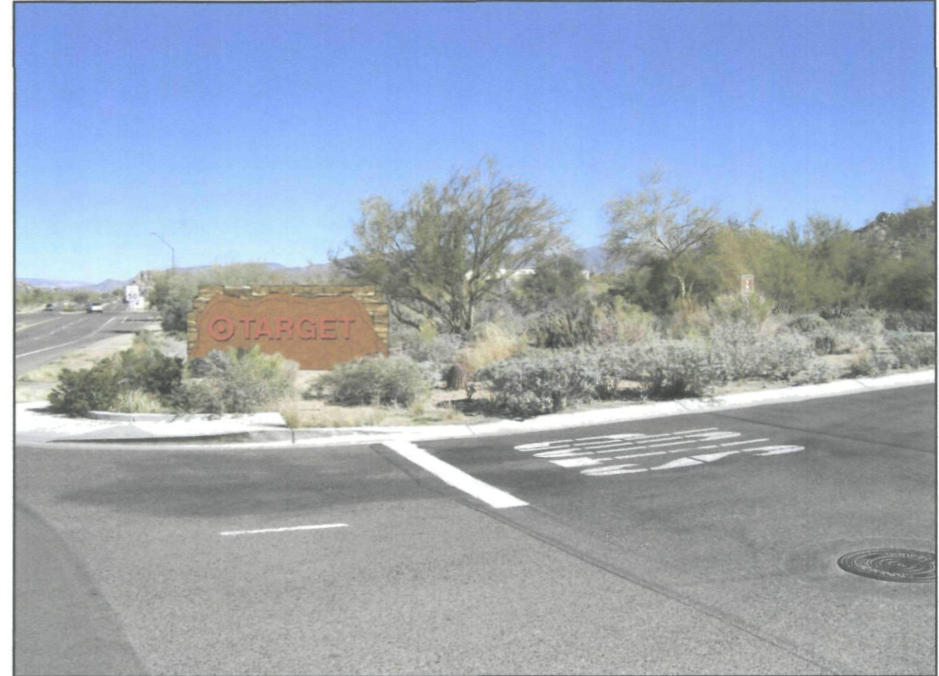
North Bound Scottsdale Road