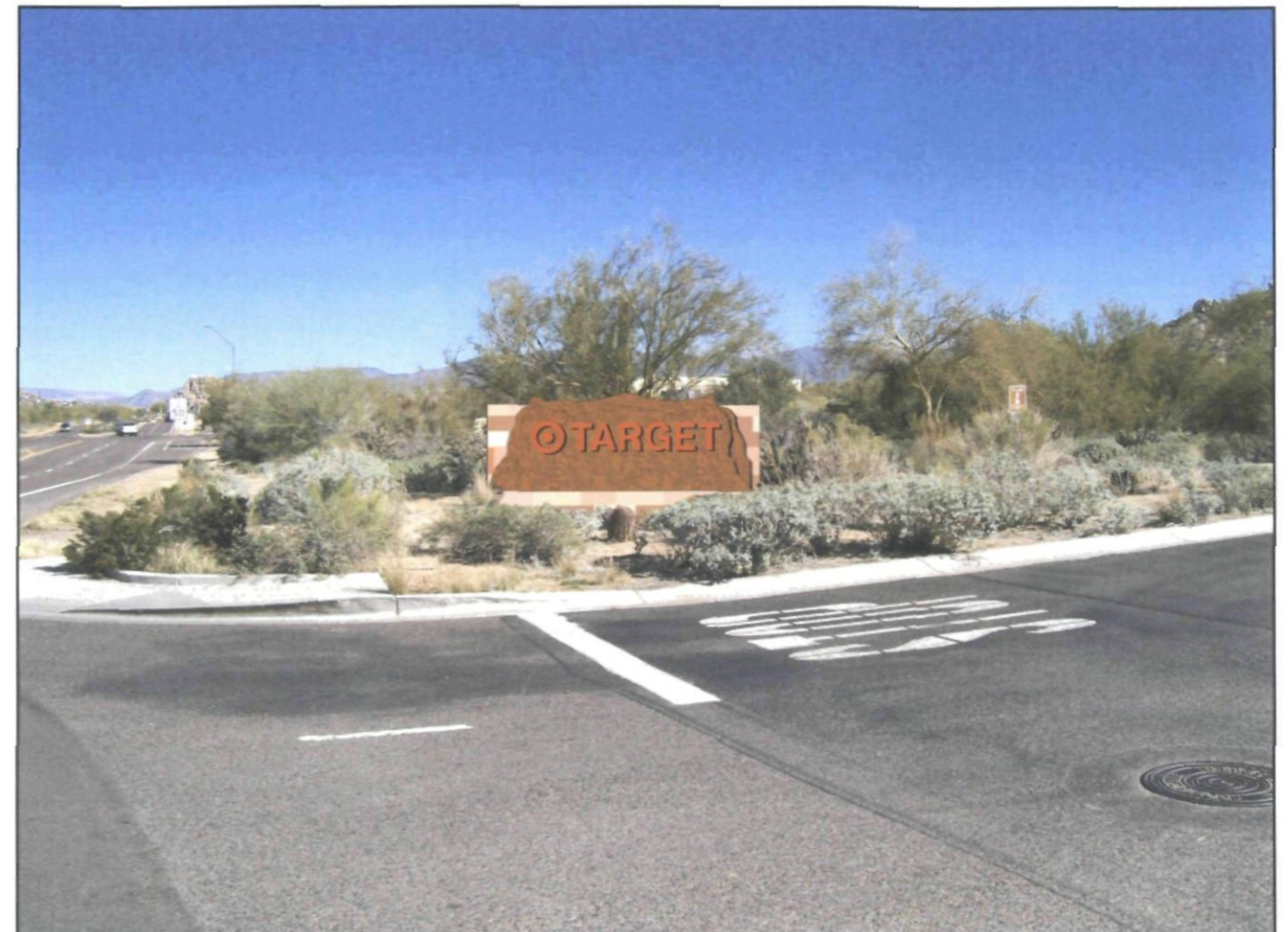
North Bound Scottsdale Road