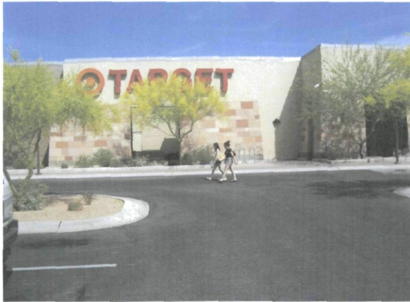
Front elevation, left side