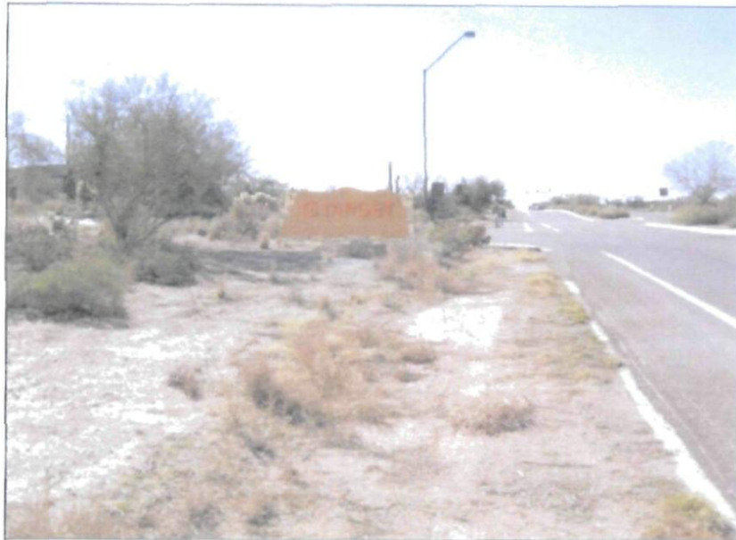
South Bound Scottsdale Road