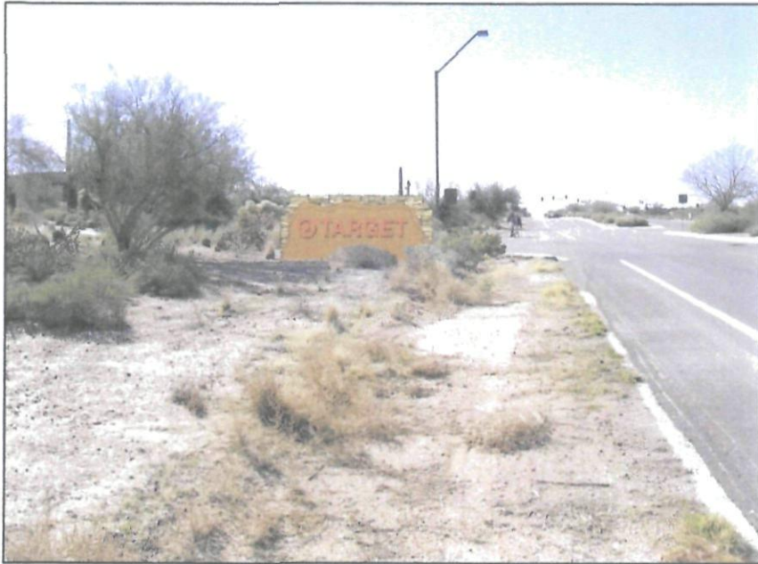
South Bound Scottsdale Road