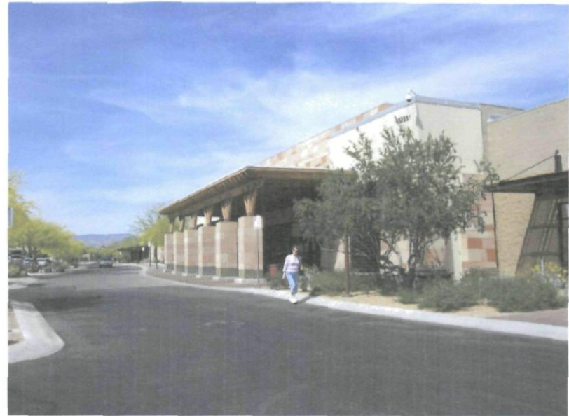
Front elevation, right side