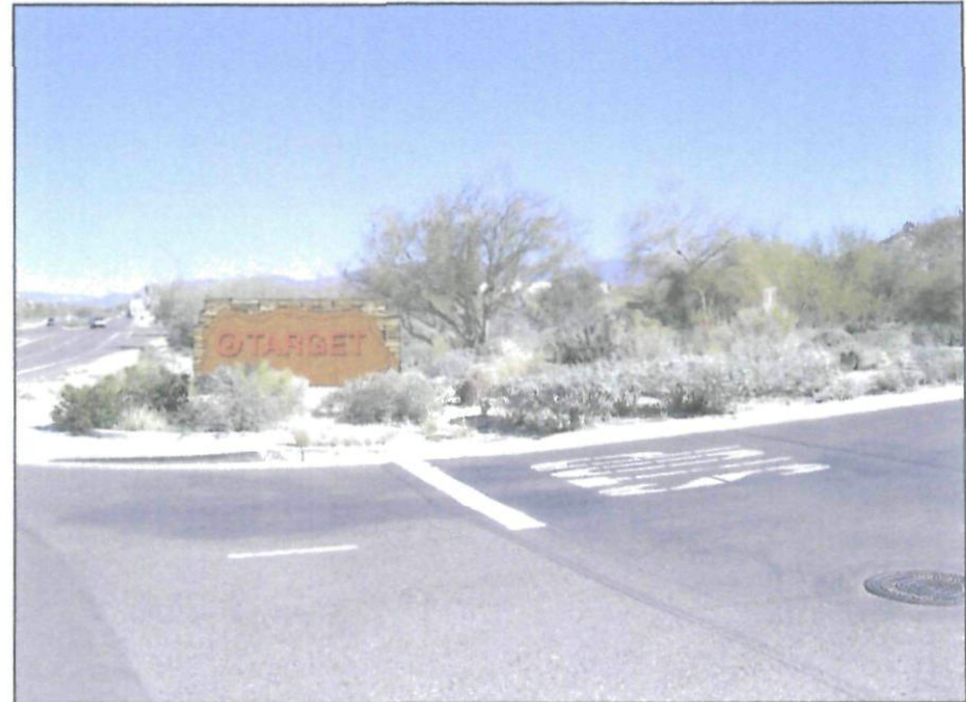
North Bound Scottsdale Road