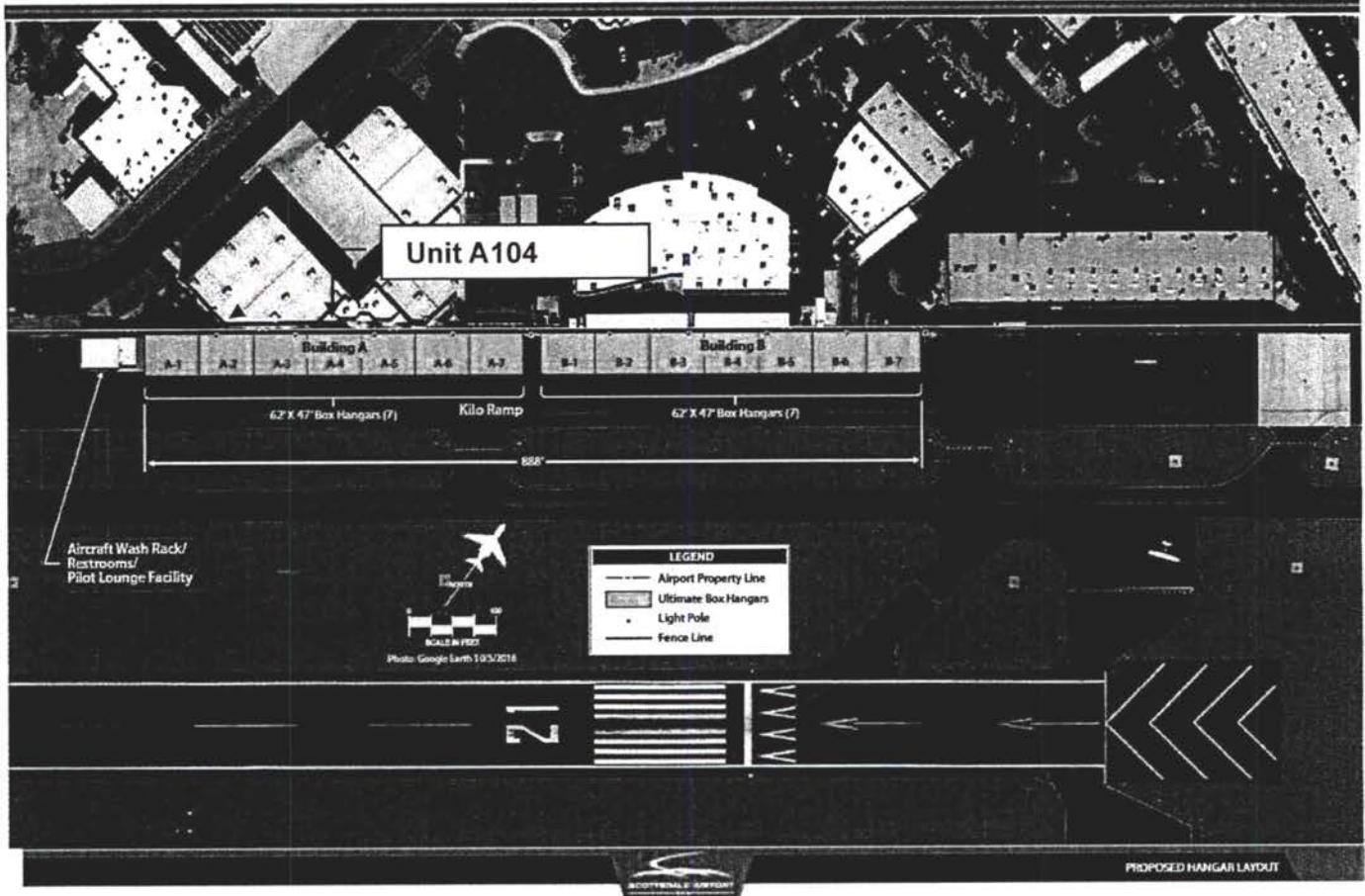
Exhibit "A" General Layout of North General Aviation Box Hangars