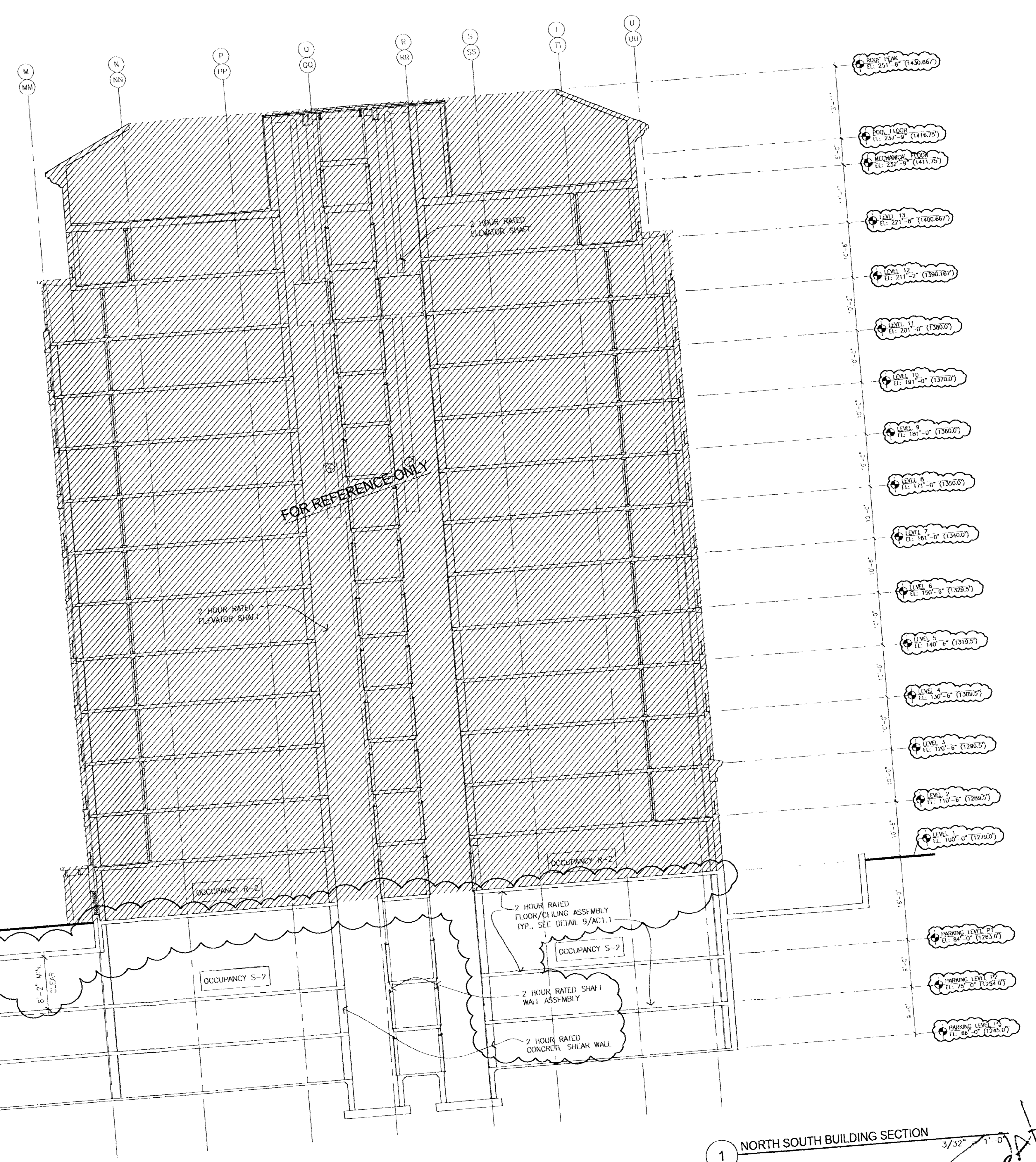
1 NORTH SOUTH BUILDING SECTION