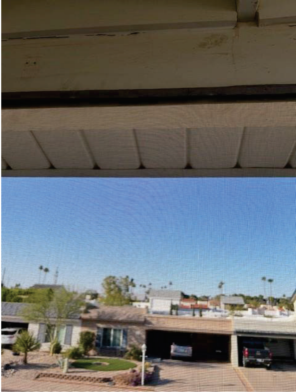
Figure 3 Interior North