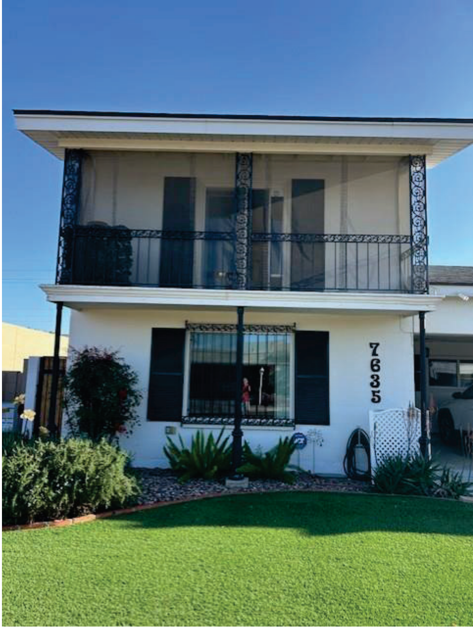
Figure 1 Street View