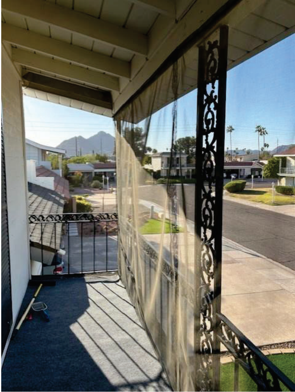
Figure 2 Interior West