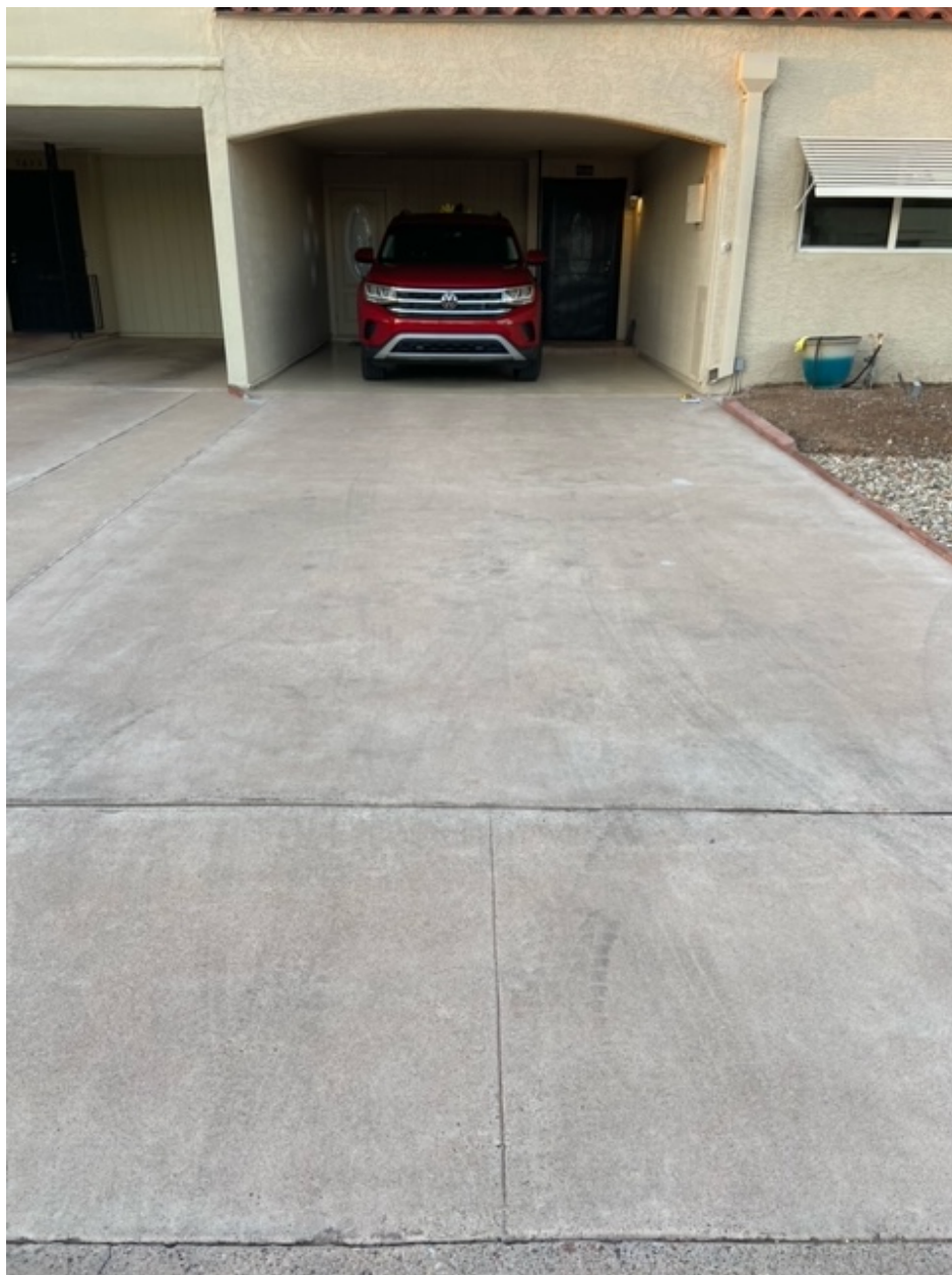
PHOTOGRAPH OF THE EXISTING DRIVEWAY