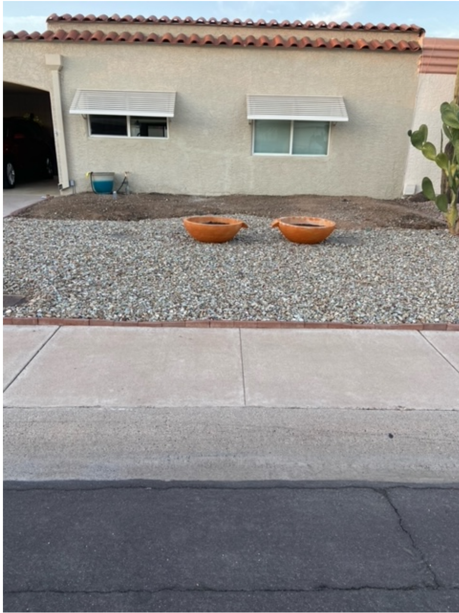
PHOTOGRAPH OF THE EXISTING FRONT YARD