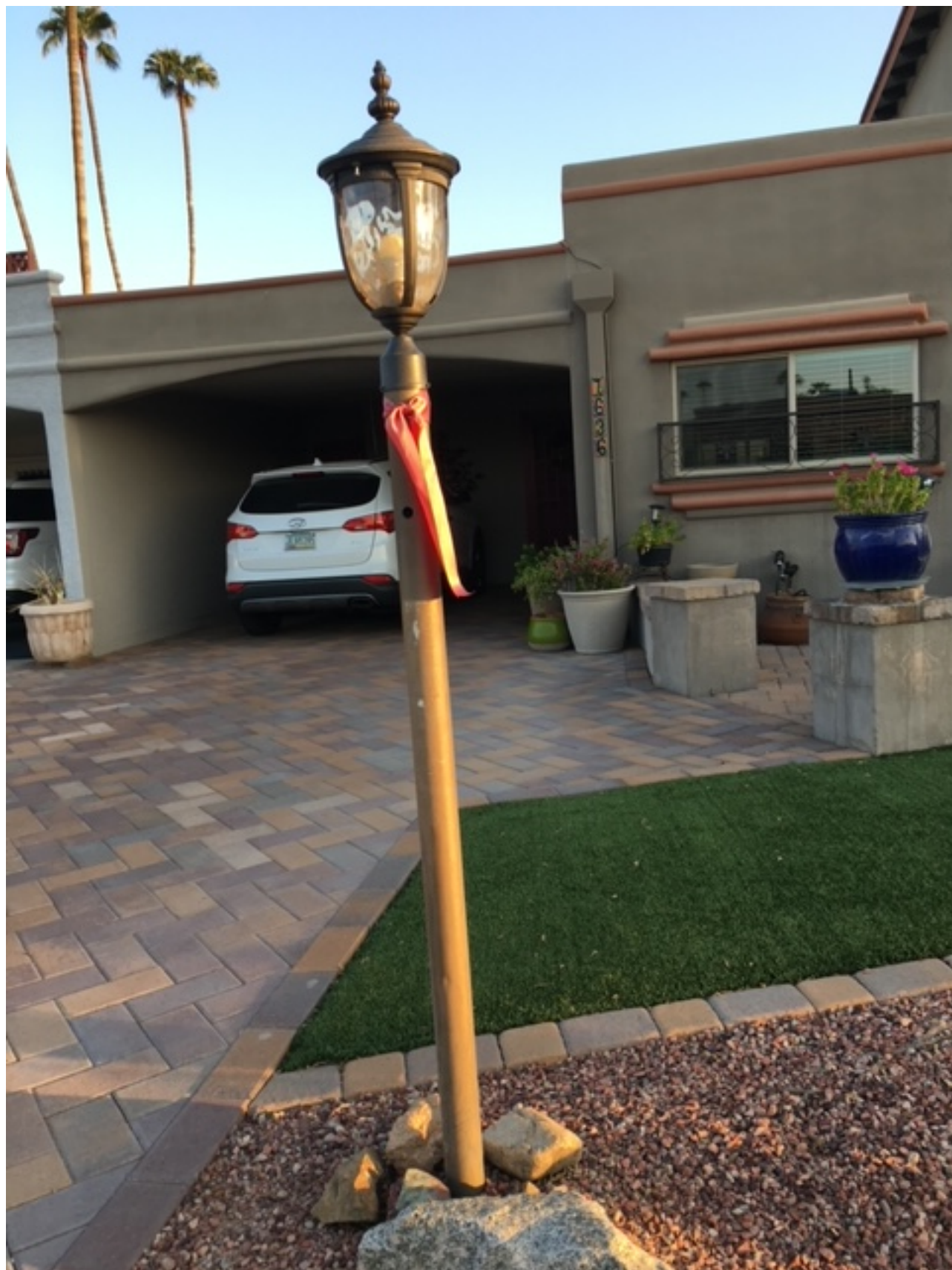
PHOTOGRAPH SHOWING THE PROPOSED PAVERS IN THE DRIVEWAY AND IN THE FRONT YARD